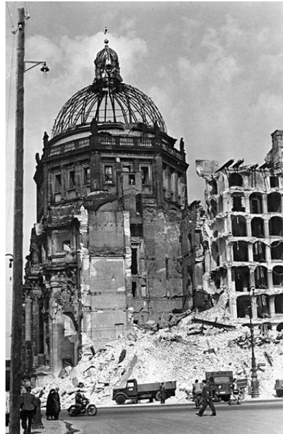
Figure 1. The Stadtschloss during demolition, 1950.