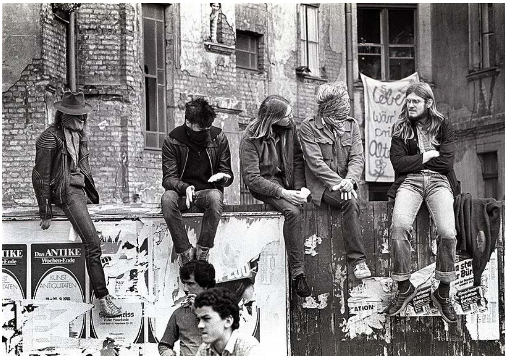
Figure 5. Squatters in Berlin, Kreuzberg (1981).