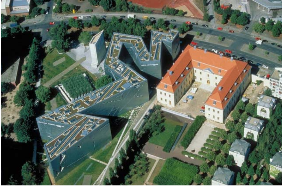
Figure 9. The Jewish Museum, Berlin.