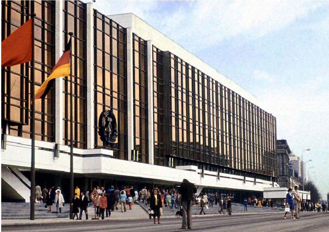
Figure 8. The Palast der Republik, 1980s.