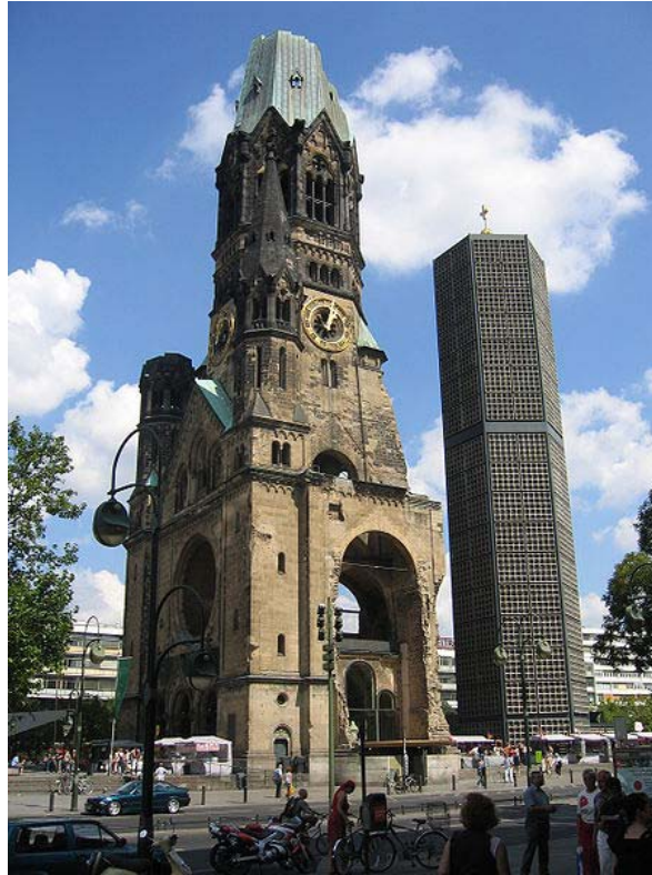
Figure 4: Kaiser-Wilhelm-Gedächtnis-Kirche.