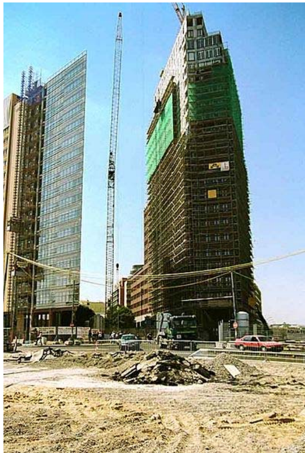
Figure 7. The Kolhoff tower under construction, Potsdamer Platz, 1999.