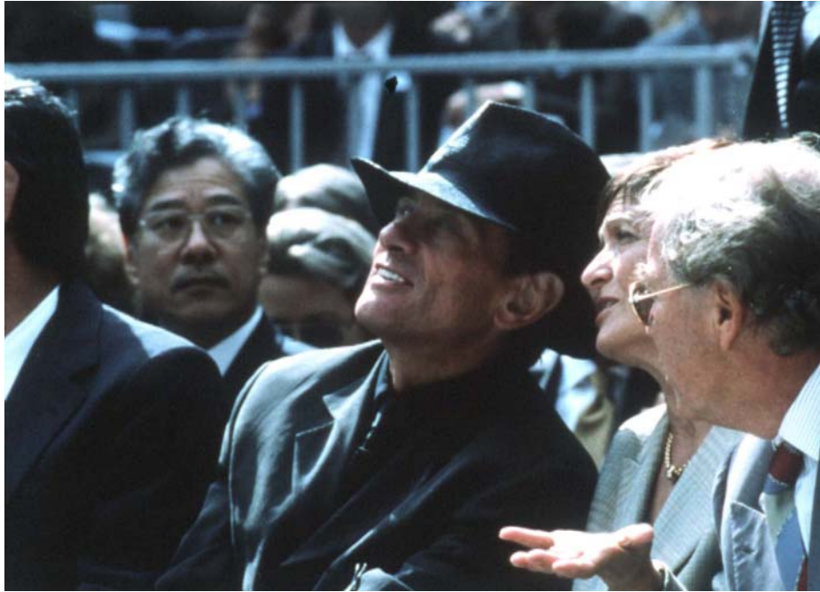
Figure 10. Helmut Jahn; still from Berlin Babylon . ( www.berlinbabylon.de/Media.Sumo/bbjahn.jpg ). Image courtesy of Hubertus Siegert/ S.U.M.O. Film.