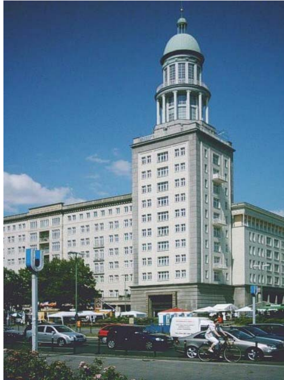
Figure 2. The Frankfurter Tor, Karl-Marx-Allee ( http://upload.wikimedia.org/wikipedia/de/5/5a/Pic00716.jpg ). Public domain.

Not all of East Berlin's buildings were designed in this grand style, however. Rather, a far plainer DDR Moderne (GDR modernism) or 'Soviet version of modernism' (Neill 2005: 338) came to hold sway. During the 1960s and 1970s, in particular, demolition—what Ralph Stern calls 'urban erasure' (2002: 128)—continued apace, as older buildings were demolished and modernist buildings, including many Plattenbauten (prefabricated high rise constructions), were erected in their place (figure 3). These buildings were far cheaper than a restoration of the buildings they replaced, and also offered modern amenities. The division of the city, consummated by the building of the Berlin Wall in August 1961, contributed to the urban scarification, particularly of the inner city, which now accommodated both the Wall and, on the Eastern side, a sizeable 'death strip' or buffer zone patrolled by dogs and armed guards ordered to shoot any East German citizens who might try to escape.