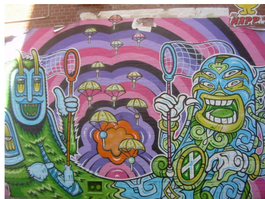
Figure 7 AC/DC Lane, Melbourne

Another strategy to preserve the permanency of street art was the placing of a Perspex panel over Banksy's 'little diver' in Swanston Street. The stencil is rumoured to have been worth 'more than an average house.' 46 However, even with the coating, 'vandals' managed to destroy Banksy's art by pouring silver paint under the Perspex and scrawling 'Banksy woz ere' over the top. 47 This 'vandalism' of Little Diver may have been a backlash against attempts to change the meaning of Banksy's work from a rebellious and ephemeral addition to public space, into a static tourist attraction/commodity – a predictable and staged product within the city's aesthetic.