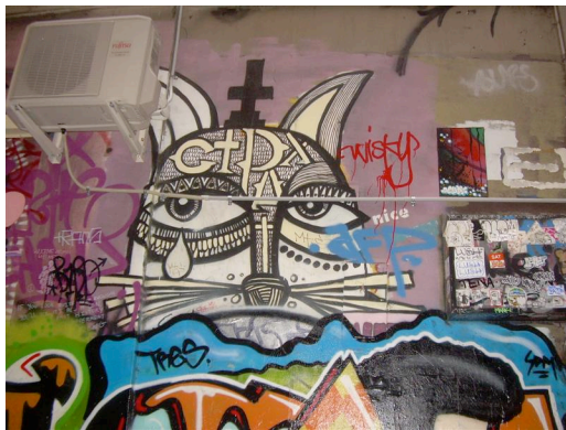
Figure 8 Hosier Lane