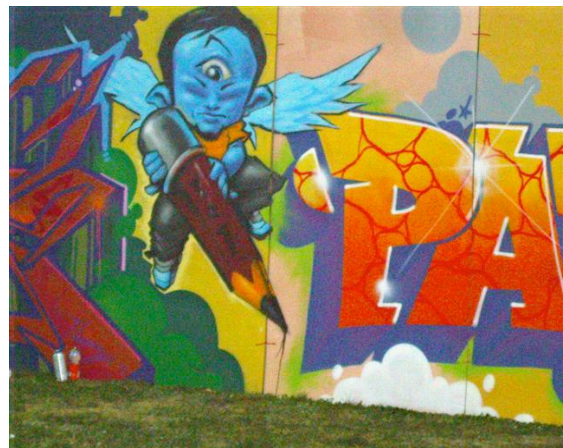
Figure 2 Art at Don't Ban the Can Protest Melbourne, 21/10/2008

aimed at encouraging the frenzied sale of consumer products. 28