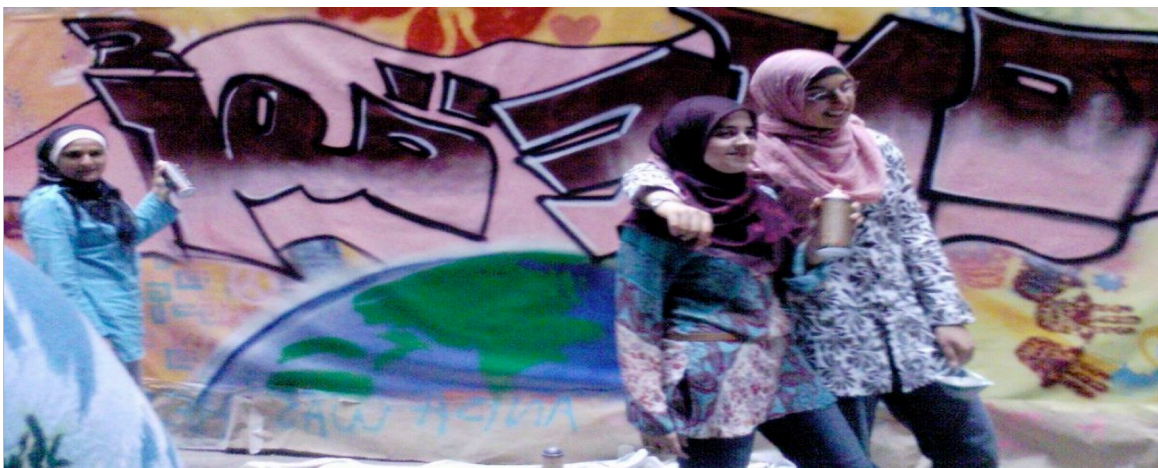
Figure 5 Crooked Rib create art at the Melbourne International Arts Festival, Sunday 26 th of October, 2008

Street artists such as Banksy and Shepard Fairey have gained fame and commercial success in part through the sale of books which contain photos of their illegal works. Street art-styled pieces have also been sold for high prices to celebrities such as Angelina Jolie, the ‘trendiness’ of the art amplified by artist’s ‘street’ (or illegal) presence. Street art has been repackaged as a consumer good, and used to sell products – including Melbourne itself. Melbourne’s international reputation as a street art hub was increasingly being recognised on the internet, and via books such as Stencil Graffiti Capital: Melbourne , published by New York publisher Mark Batty. 31 Tourist organisations, for example, Lonely Planet, declare that Melbourne’s top cultural attraction is its laneways, complete with brightly coloured murals. 32 Marcus Westbury, art curator and event manager, hosted a TV show Not Quite Art which featured an episode exploring