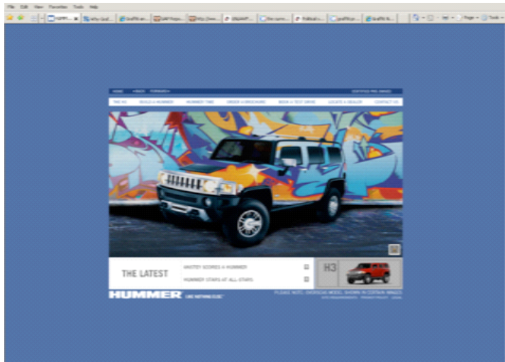
Figure 9 Hummer 'Now Get Lost' Advertising Campaign Online