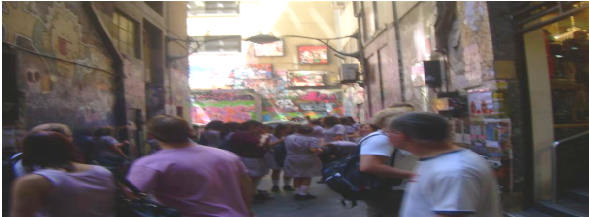
Figure 11 School children and tourists observe graffiti in Centre Place, Melbourne