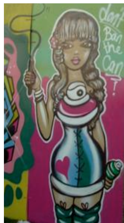
Figure 10 Don't Ban the Can - Art from the Protest

system, which attempted to tame the spontaneity of street art, has now been modified by the Activities (Street Art) Local Law 2009 . One purpose of the amendment to the Activities Local Law is to: ‘ensure consistency with the Graffiti Prevention Act 2008 ’. The amendment does