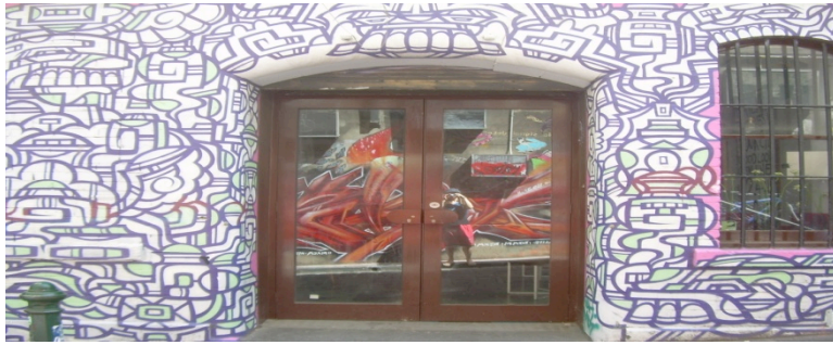
Figure 4 Hosier Lane, Melbourne

Street artists such as Banksy and Shepard Fairey have gained fame and commercial success in part through the sale of books which contain photos of their illegal works. Street art-styled pieces have also been sold for high prices to celebrities such as Angelina Jolie, the ‘trendiness’ of the art amplified by artist’s ‘street’ (or illegal) presence. Street art has been repackaged as a consumer good, and used to sell products – including Melbourne itself. Melbourne’s international reputation as a street art hub was increasingly being recognised on the internet, and via books such as Stencil Graffiti Capital: Melbourne , published by New York publisher Mark Batty. 31 Tourist organisations, for example, Lonely Planet, declare that Melbourne’s top cultural attraction is its laneways, complete with brightly coloured murals. 32 Marcus Westbury, art curator and event manager, hosted a TV show Not Quite Art which featured an episode exploring