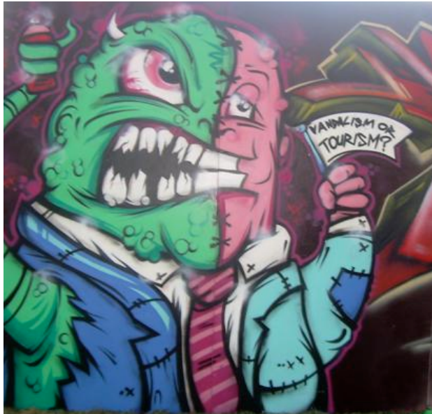
Figure 6 'Vandalism or Tourism?' - Art created at 'Don't Ban the Can' Protest against the Graffiti Control Act, 21/10/08

was brought out by Melbourne City Council's Community Cultural Development Program as part of the Melbourne International Arts Festival to create a graffiti mural with Crooked Rib in a Melbourne laneway. 35