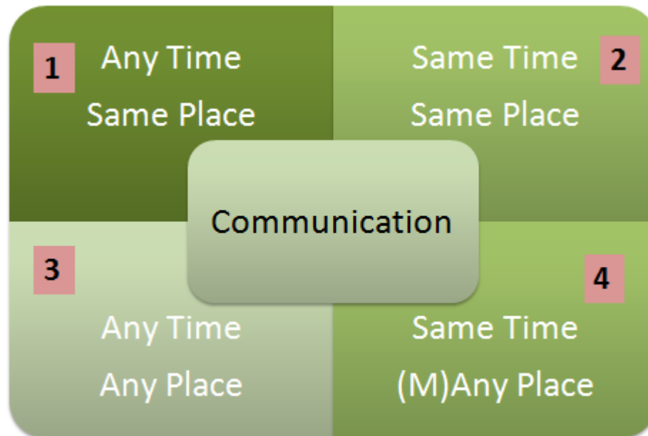
Figure 2. Communication framework: communicating with students face to face

In this section, we describe the communication that takes place between faculty and students and among students (Figure 2).