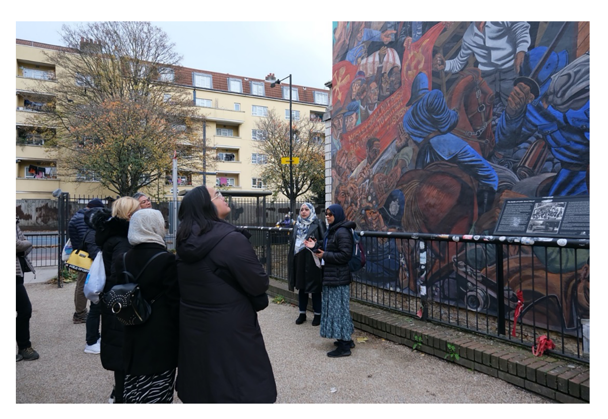
First stop on the tour

The establishment of the docks in Tower Hamlets by The East India Company in 1802 underpins so much history. Its vast colonial, military, and slavery project created an infrastructure of large warehouses, docks, factories, and rows of terraced houses which transformed the borough and its residents (Aziz 2021; Brown et al. 2019). Situated close to the Thames and the City of London, Tower Hamlets became a site for colonialists, global merchants, industrial elites, and shipping-based businesses working in the colonies and the slave trade. Generations of migrants, refugees, and labourers, many of whom worked for The East India Company, or merchant ships or were British subjects from the colonies, transformed the Borough (Aziz 2021: 7). Men from India, Somalia, Yemen, and China, settled after working in The East India Company, the Merchant Navy, and the shipping industry in the nineteenth and early twentieth centuries; women much later.