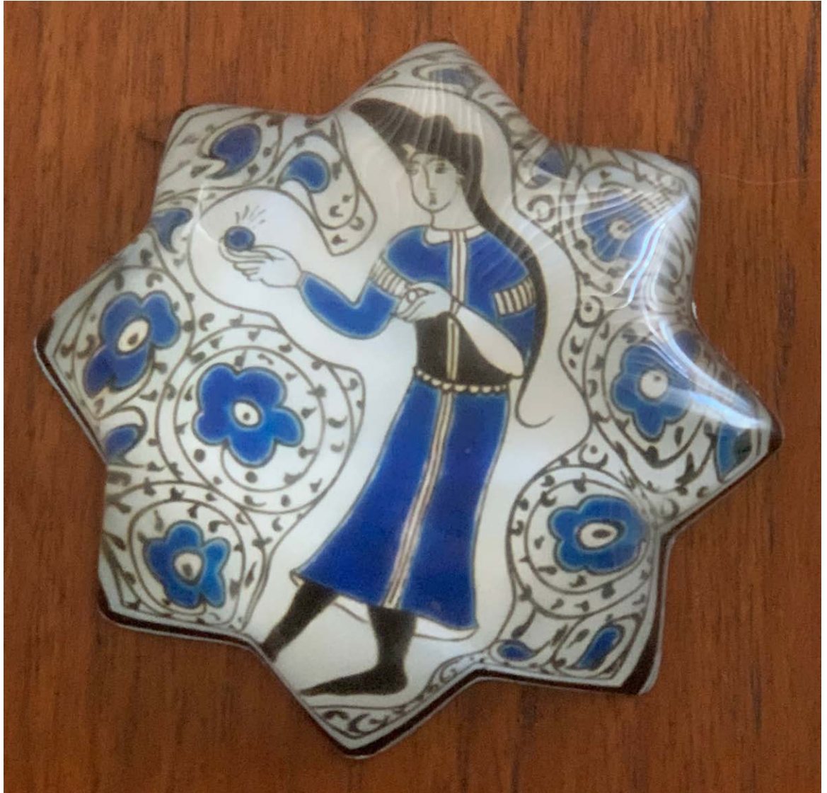
Figure 1. Souvenir paperweight from Turkey