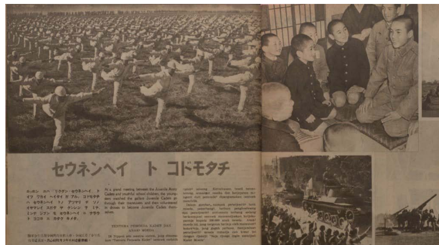
Figure 6. 'Shōnen-Hei to Kodomotachi' [Youth Soldiers and Children], Taiyō [The Sun], 1944, vol. 3, no. 1: 10–11.

beginning of the modern boy's emergence in Japanese society, when the new ideas of masculinity he represented were increasingly denounced, so much so that few people, if any, self-identified as one. 6