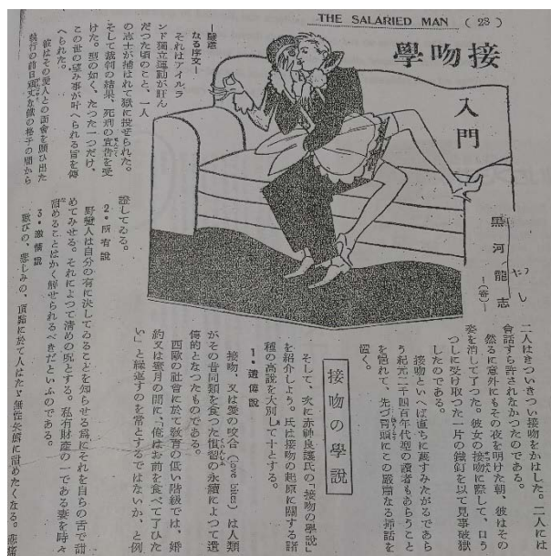
Figure 1. 'The Art of Kissing,' The Salaried Man , 1930, vol. 3, no. 7: 28.

The modern boy's emergence and subsequent disappearance in media discourses therefore need to be analysed as indicative of the changing discourses of gender, modernity and identity during the interwar period. The interwar trajectory of the modern boy provides a certain insight into the processes of gender construction, stigmatisation and erasure in Japanese interwar society. We can trace the power dynamics involved in the social elevation of salaryman masculinity and the erasure of modern boy masculinity, despite overlaps and interconnections between the two. In this brief essay, I touch on deepening anxieties regarding female emancipation and what was seen as 'Western' modernity. These anxieties underpinned many negative portrayals of the modern boy. I explore how the modern boy's erasure as a relevant and socially viable masculinity in interwar Japanese society was discursively engineered and co-opted for the consolidation of a patriarchal and nationalist masculine identity.