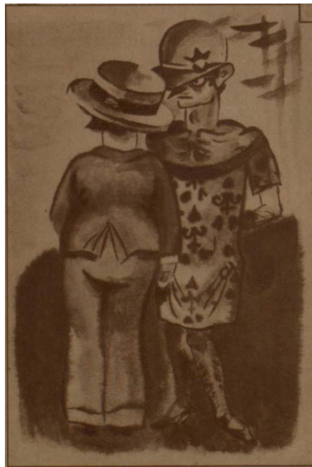
Figure 2. 'Moga mobo fuku no torikae' [Moga Mobo Clothes Swap], Asahi Gurafu [Asahi Graphic], 1928, vol. 11, no. 10: 21.

A salient aspect of the modern boy discourse was the notion that the modern boy and modern girl blurred fixed notions of gender. At a time when a female work force was emerging and female progressiveness was celebrated as part of Japan's new modern culture (Harootunian 2000: 9–12, 25), representations featuring the heterosexual dynamic of the moga mobo relationship typically positioned the modern girl as a dominant and threatening woman in antagonistic opposition to an emasculated and feminised/effeminate modern boy. The modern boy therefore was commonly associated with gender ambiguity or cross-dressing tendencies (Figures 2 and 3) or depicted as a powerless victim of the modern girl (Figure 4). These illustrations articulate an anxiety regarding what was perceived as a role reversal between the sexes, which needs to be contextualised within the debate surrounding the heterosexual dynamics of power and the apparent emancipation of women in interwar Japanese society.