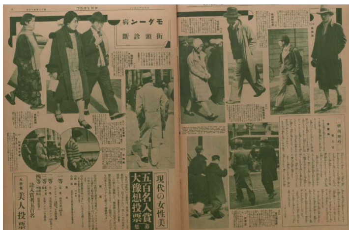
Figure 5. ‘Modan-Byō’ [Modern Disease], Asahi Gurafu [Asahi Graphic], 1929, vol. 12, no. 15: 4–5. The text reads: ‘Tokyo is changing, like the rest of the world. For one thing it is by degrees getting used to its “moba” and “moga”. What may look silly to one is the supreme raison d’être of another! Here are shown some of those sufferer[s] from “the strange disease of modern life” in Tokyo.’

Aside from deepening gender anxieties, fashion pictorials depicting the fashionable modern boy and girl in the late 1920s and early 1930s also increasingly express anxieties over a Western modernity that was perceived as incommensurate with interwar Japanese society and identity. A 1929 fashion spread, for example, labels modernity as a ‘disease’ and modern girls and boys as sufferers of this disease (Figure 5). Essentially, modernity in Japanese society was being fragmented into Western and Japanese constituents that were constructed as oppositional and mutually exclusive. This splitting of modernity and identity into Eastern and Western constituents involves equating Western modernity with the modern girl and boy. The modern boy is presented as a non-indigenous construct: a Westernised, ‘foreign’ person who needs to be expelled from Japanese society in the consolidation of an authentic Japanese identity.