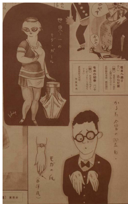
Figure 4. Asahi Gurafu [Asahi Graphic], 1928, vol. 10, no. 2: 8. The threatening figure of the modern girl is juxtaposed with the wounded modern boy who bears scars on his hands from her claw-like fingernails.