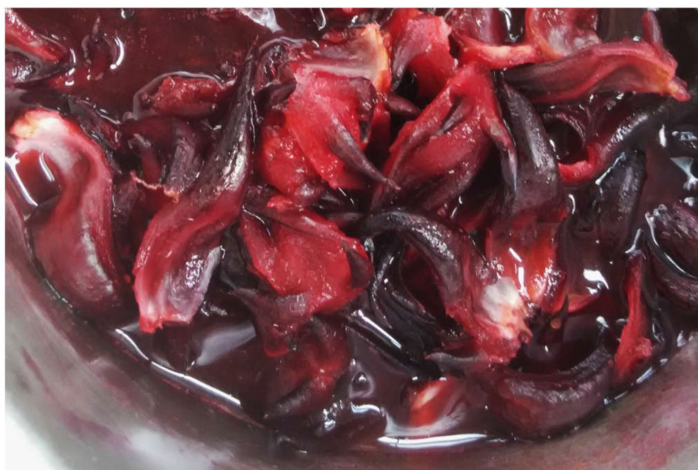
Figure 1 © Ili Farhana