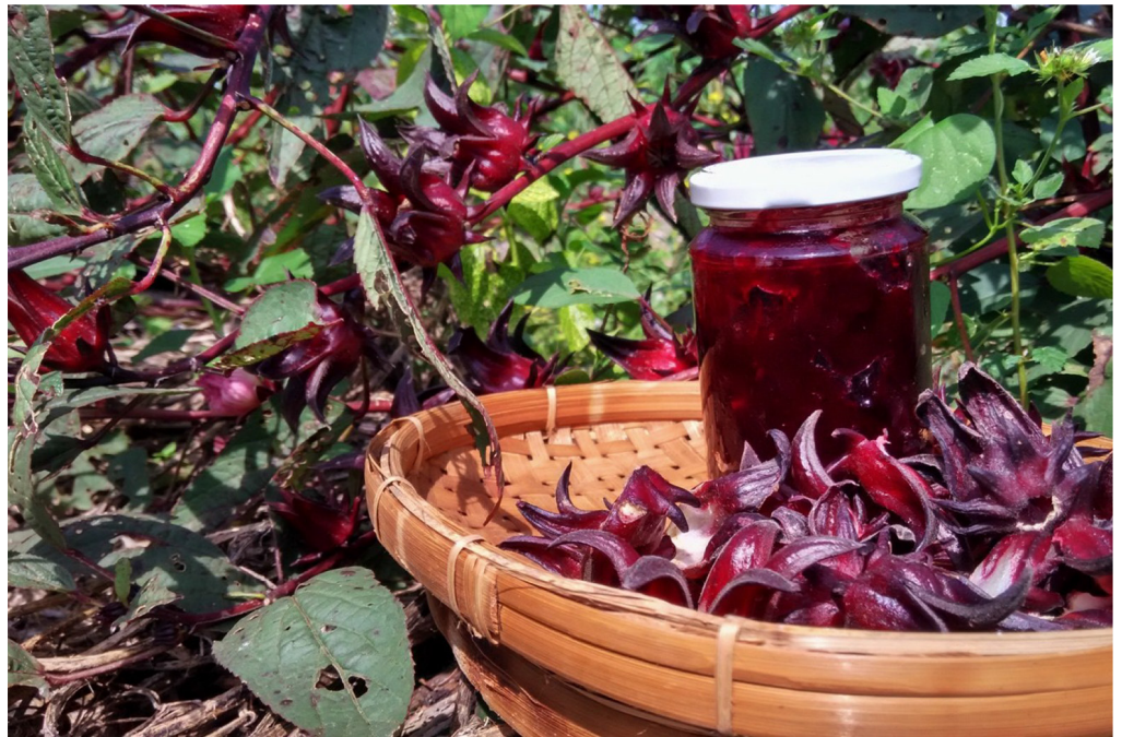
Figure 5 © Ili Farhana