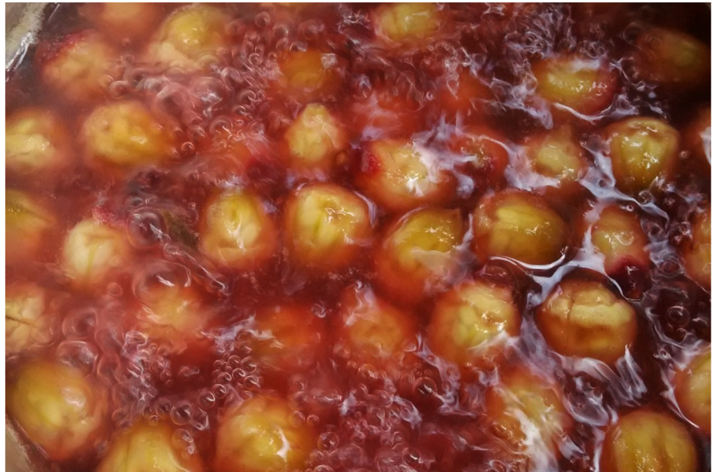
Figure 2 © Ili Farhana