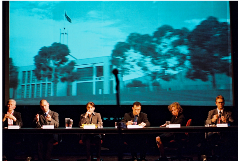
Figure 1: version 1.0's CMI .

many researchers, including myself, have been trying to explain the performances' strong impact. In the context of past academic writing about CMI , my article is written with the purpose of acknowledging the ongoing relevance of this work, and analysing its aesthetic approach and effects.