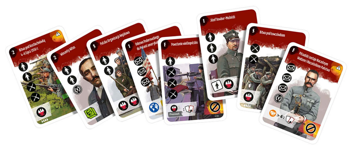
Figure 7. Cards from Niepodległa game. Available: <u>https://edukacja.ipn.gov.pl/edu/materialy-</u> <u>edukacyjne/gry/gry-planszow/82236,Niepodlegla.html</u> (Accessed: 2 January 2023)

about the game, the IPN website also includes instructions, a historical study and the excellent three-part memoir of the game's designer, Jan Madejski, which contains a wealth of valuable information and historical references. ^{30}