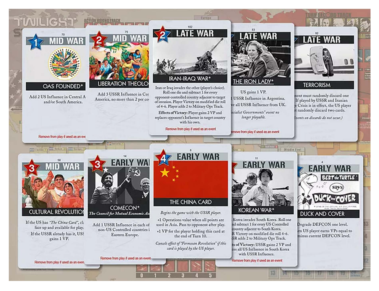
Figure 9. Sample cards from the Twilight Struggle game. Available: <u>https://boardgamegeek.</u> <u>com/boardgame/12333/twilight-struggle</u> (Accessed: 2 January 2023)

do not have such comfort in a situation where there are only opponent's cards left in the hand to be played. Thus, by playing them we face unfavorable consequences.