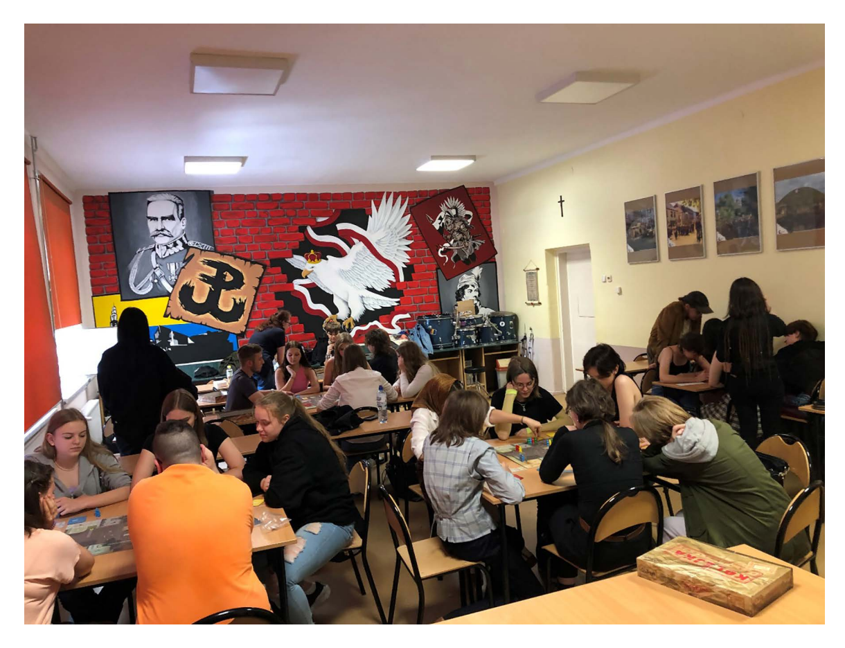
Figure 3. School Kolejka Playoffs 10 June 2022.

Two elements were mentioned in post-game interviews. The first was great excitement among the young people and satisfaction with such a formula of lessons defined by them as learning through play. Most often