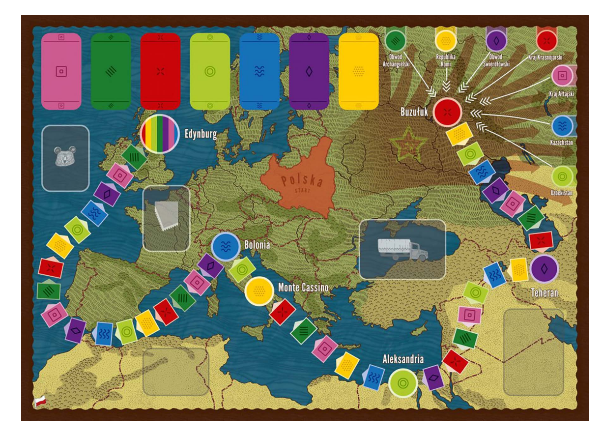
Figure 4. Miś Wojtek Game Board Available: <u>https://edukacja.ipn.gov.pl/edu/materialy-</u> <u>edukacyjne/gry/gry-planszow/82248,Mis-Wojtek.html</u> (Accessed: 28 December 2022)

In Poland, both history and Polish language teachers use the game, because in the second grade of elementary school, one of the readings is a book introducing the fate of Wojtek Bear.<sup>26</sup> The whole story is very much enjoyed by children and arouses great curiosity. Children ask a very large number of historical questions of various types. Some examples taken from conversations with parents in my then eight-year-old daughter's class are: What was the war? Why did the Poles find themselves so far away from Poland? Who