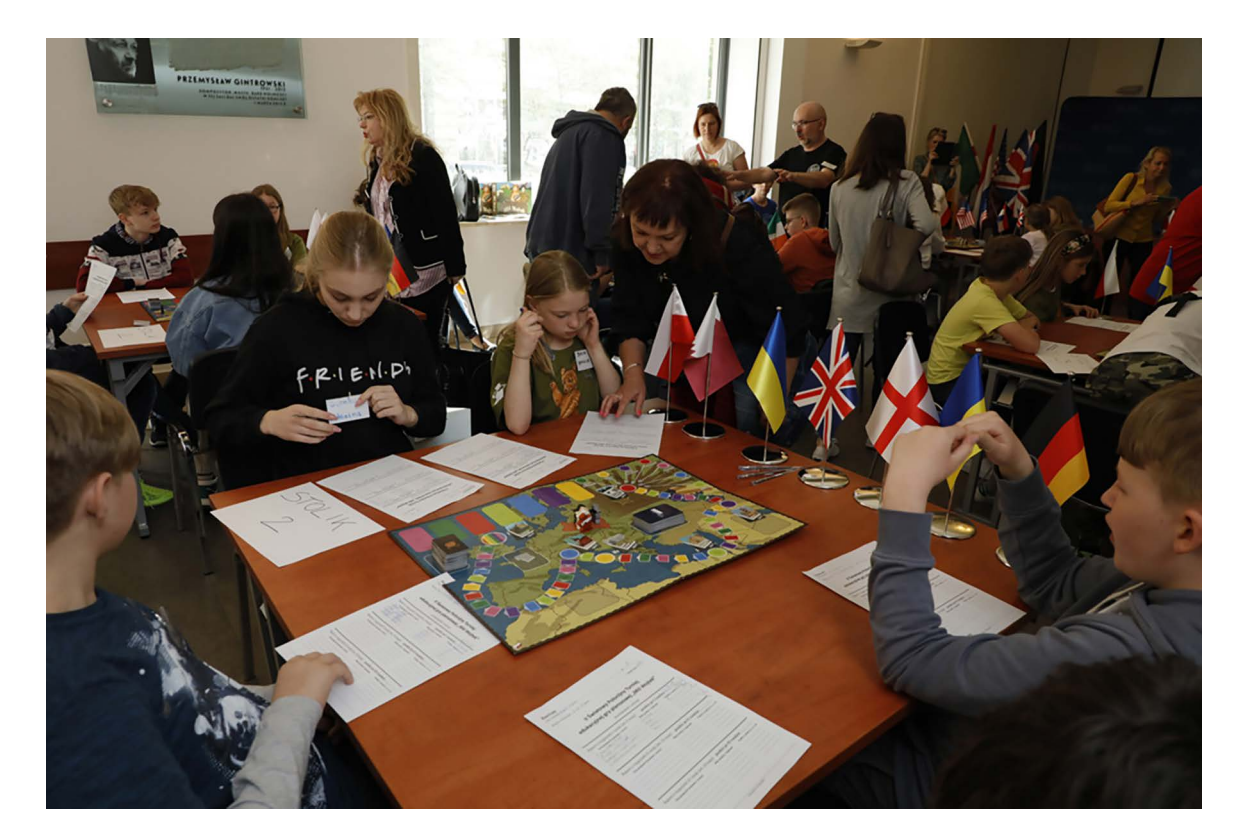
Figure 5. Inauguration of the final games of the Miś Wojtek board game tournament, May 10, 2022. Photo Piotr Życieński (IPN) Available: <u>https://ipn.gov.pl/</u> pl/aktualnosci/164248,Inauguracja-finalowych-rozgrywek-turniejugry-lanszowej-Mis-Wojtek.html (Accessed: 28 December 2022)

Taking advantage of the popularity of the bear's adventures, IPN is organizing ' Mis Wojtek ' Polish Educational Board Game Tournament for all Polish schools around the world (Figure 5).<sup>28</sup> The games are organized online. Schools submit two-person teams of children between the ages of eight and sixteen. In the 2022 school year, sixty-one teams from nineteen countries participated in the regional competition, including the United States, Italy, Iceland, Canada, Turkey, Qatar, Egypt and Spain. 2023 featured 120