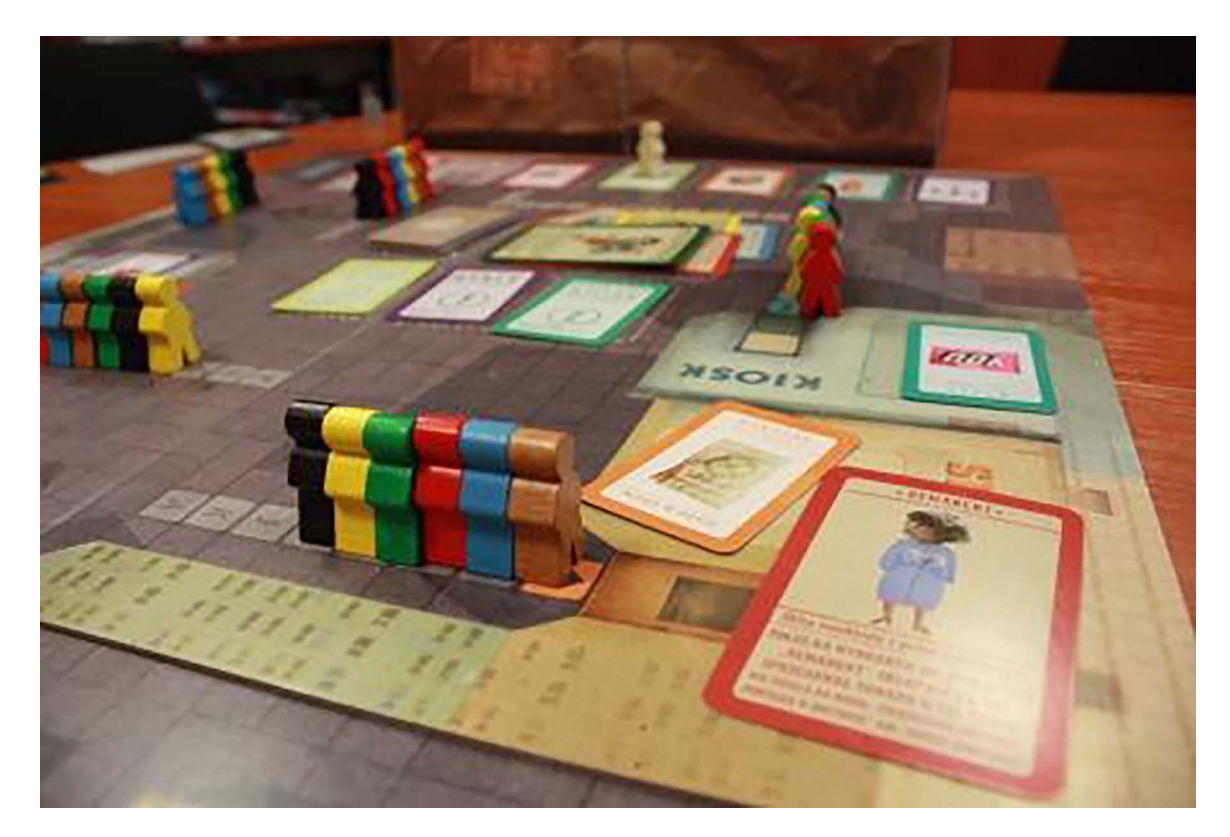
Figure 1. Kolejka game board. Available <u>https://edukacja.ipn.gov.pl/edu/materialy-edukacyjne/</u> gry/gry-planszow/93066,Kolejka.html (Accessed: 28 December 2022)

The game's instructions introduces us to this atmosphere from the first pages in a few sentences of text stylized in the propaganda language of party-government messages warning players: 'We kindly inform you that the moment you open the box you have found yourself in 1980s Poland,' therefore, 'Please do not panic and calmly take your place in queue. Delivery is on the way, and maybe there will be enough goods for everyone.' It also includes numerous archival photographs of people standing in long lines, empty store shelves and customers proudly wearing 'wreaths' made of toilet paper rolls around their necks. The game is designed for two to five people aged twelve and up, but younger students can handle it too. Each player gets a set of wooden pawns in a different color forming members of his family whose goal is to get all the items listed on a random shopping list with a specific task (Figure 1). The player who completes the list first wins but the matter is not so simple.