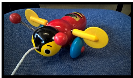
Figure 1: The Buzzy Bee

As Figure 1 shows, the Buzzy Bee is a brightly coloured – red, yellow, black and blue – pull-along child's toy. The Bee is fourteen centimetres in length with a wingspan of seventeen centimetres. As the Bee moves forward, its yellow paddle wings rotate, its sprung antennae vibrate and the Bee makes a curious clicking sound. That sound derives from a short vibrating metal bar, similar to a music box prong. The noise is activated as the wheels of the Bee turn and the short metal bar hits a protrusion on the Bee's wheeled axel.