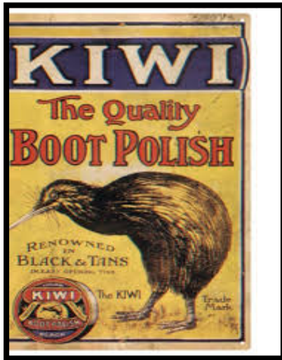
Figure 3: Kiwi boot polish 39

Zealand. The Kiwi/soldier connection can be traced back to William Ramsay, the inventor of Kiwi-branded boot polish (Figure 3). 37 Museum curator and historian Richard Wolfe estimated that following World War One, 30 million cans of Kiwi nugget had been sold globally. 38