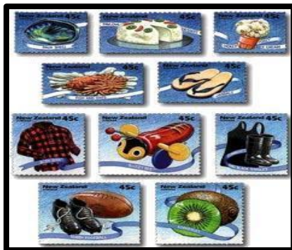
Figure 7: New Zealand Post Millennium kiwiana stamp issue. 81

Claudia Bell described kiwiana as ‘popular cultural items that distinctly reference New Zealand [that were] locally manufactured items originating mainly in the 1940s-1950s, when import restrictions limited the availability of household goods.’ 82 Carlyon and Morrow speculated that after World War Two innovation was important, because ‘returning to a comfortable life of plenty was not immediate, for either veterans or the general populace’. 83 Then, a comparatively closed economy and the nation’s geographical isolation fostered a conservative worldview. 84 Brickell best encapsulated this view of the times as follows: