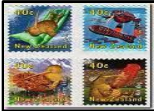
Figure 6: New Zealand Post 1994 kiwiana stamp issue. 80