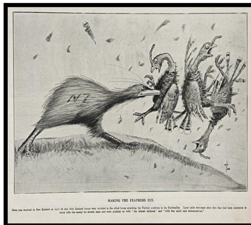
Figure 4: Making Feathers Fly 42

Because of war and Kiwi-branded nugget cans, Wolfe commented that: ‘the obvious association was made, and everyone began calling the New Zealander[s] a “kee-wee” ... by the time another World War came around, “Kiwi” was second nature’. 41