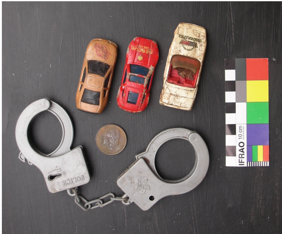
Figure 3 85 Fairview Street: gutter assemblage

empathically and imaginatively connect me with place, and temporally with my own childhood. I envision and sense, but can never know, the lived-in, recent past.