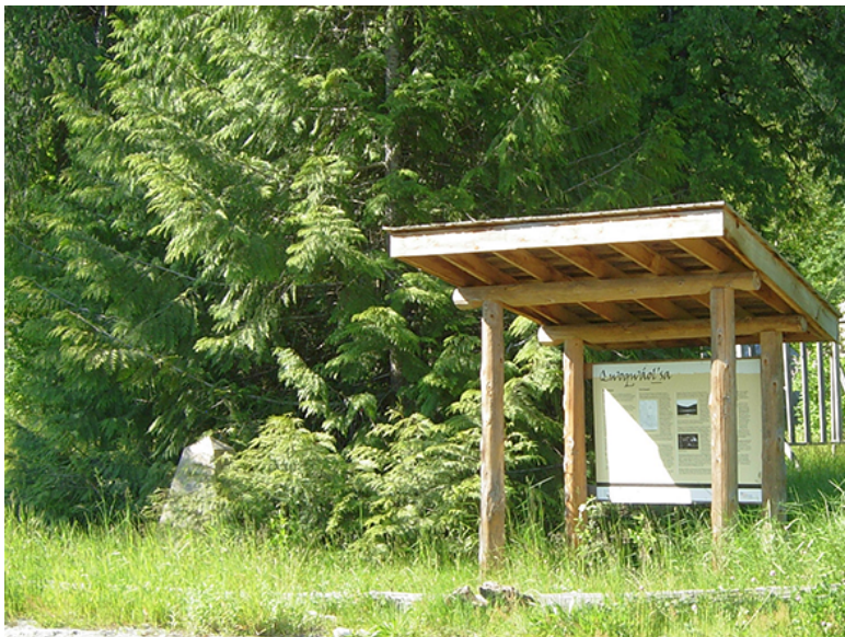
Fig 4 Information board at Qwoqwaol'sa (Port Douglas) with cairn commemorating the Gold Rush in background (Photograph the author)

The importance of the wagon road to the Stl'atl'imx of the lower Lillooet River Valley goes beyond official definitions of what 'heritage' is or is not. The wagon road holds an important place in their social landscape linking people from the past and present together. 45 Here heritage and memory are tightly linked. Remembering and sharing stories of building, using and tending the wagon road is part of making, conserving and nurturing heritage. 46 It is through the active process of remembering that the meaning and significance of the wagon road is negotiated. 47 While students may walk the road and transform themselves through this practice, the Stl'atl'imx of the lower Lillooet River Valley are part of the road itself. Their stories tell of how their lives are entwined and entangled in the road – as they are with other parts of their landscape, its human and material aspects – in a way that cannot be detached from who they are. While they may leave their traditional territories, they take the road with them.