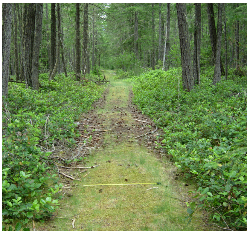
Fig 2 The wagon road, looking north, with 1 metre scale

It became evident early on in my research that the wagon road held a place of great significance to the Stl'atl'imx of the lower Lillooet River Valley. I naively arrived to their traditional territories prepared to survey the 1850s 'Gold Rush Road' and discuss its role as a colonising feature in their physical and social landscape. Known mainly for its Gold Rush past, I was under the false assumption that this road would be viewed by the Stl'atl'imx people as colonising, associated with the dispossession of their land and subjugation of their people. Instead, the wagon road was regarded with pride, associated with ancestors, community and tradition (Figure 2). The six years that the road was used as a route to the gold fields meant little in comparison to its role in their daily lives and those of their ancestors in the intervening 150 years. It was the embodied routine ( habitus ) of using and maintaining the wagon road that created and reaffirmed its place in memory and in their social lives. 8