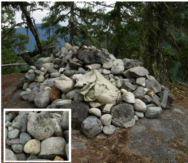
Fig 3 Cairn at Moody's Lookout, looking south down Little Lillooet River Valley

And what I used to tell the students to encourage them, because they didn't want to hike this hill, was that if they carry the rock to the top of the hill and put it here that they could do anything they wanted in life because they would know that it was here and they knew that they did something that they didn't really want to do. Now the latest thing is that people are bringing felt pens and they are writing on the rocks so people know... Just about every student who has hiked the Harrison Hike has been up here since 1976. So that's our secret vocabulary. Use 'Moody's Lookout' and no one in the world knows where it is except kids who have been up here. 33