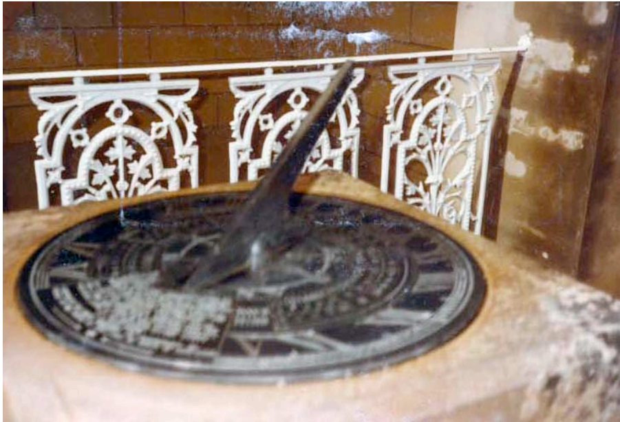
The Sundial was removed from the Gundagai Court House to the front part of the Local Museum, Gundagai