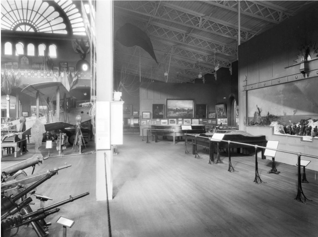
The exhibition as it appeared in Sydney at the Exhibition Building at Prince Alfred Park from 1925 until 1935

museums, he says, 'they do not leave their cultures and identities in the coatroom.' 7 But how are we to open this up to historical analysis? How might museum practitioners from the past have understood these processes? This is a challenge that few museum historians in Australia have attempted. Even though the Australian War Memorial has a long and, in places, well documented exhibitions history, it is not easy, at this distance, to capture the conversations between curators and visitors generated by long-past exhibitions. But throughout this article I have tried to offer this perspective where possible.