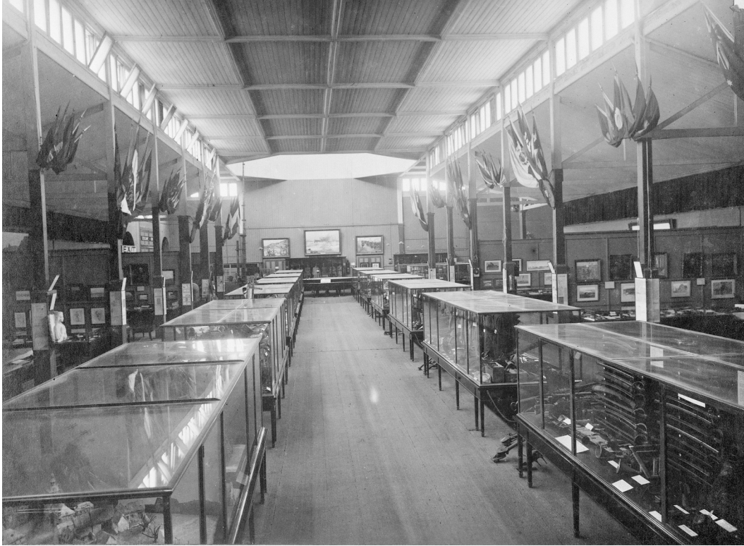
The Exhibition Building in Melbourne housed this, the first major exhibition held by the Australian War Museum (later Memorial). It opened in April 1922. In amongst the plethora of material were documents

objects. How might it have been represented to the visitor? What chain of imaginings and memories did it generate? In short, I want to wonder at and analyse the power of the document, not just for its content as represented literally by the words on paper, but for its properties as an artefact.