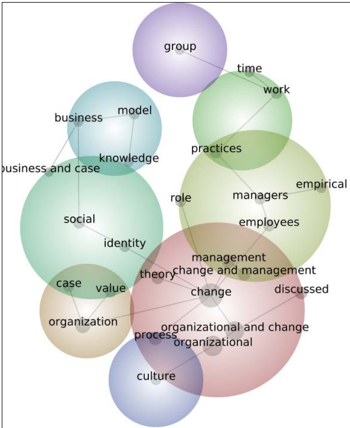
Figure 2. Concept map for the specialist literature on change management

It is also possible to develop an understanding about how these groups engage with the concepts of people and organisation, and the level of abstraction at which they discuss change management. ‘Firm’, ‘performance’, ‘strategy’, ‘industry’, and ‘environment’ were all significant concepts in the general management corpus. The general management texts tended to discuss the role of change management in strategy development and execution