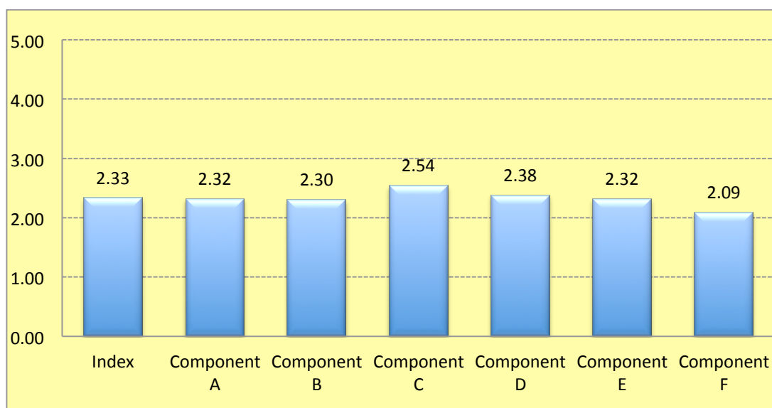
Figure 2: Forest, land and REDD+ PGA Index

Note: Component A: Laws and regulations, Component B: Government Capacity, Component C: Citizen Capacity, Component D: Indigenous, Local and Women Capacity, Component E: Business Actor Capacity, and Component F: Performance.