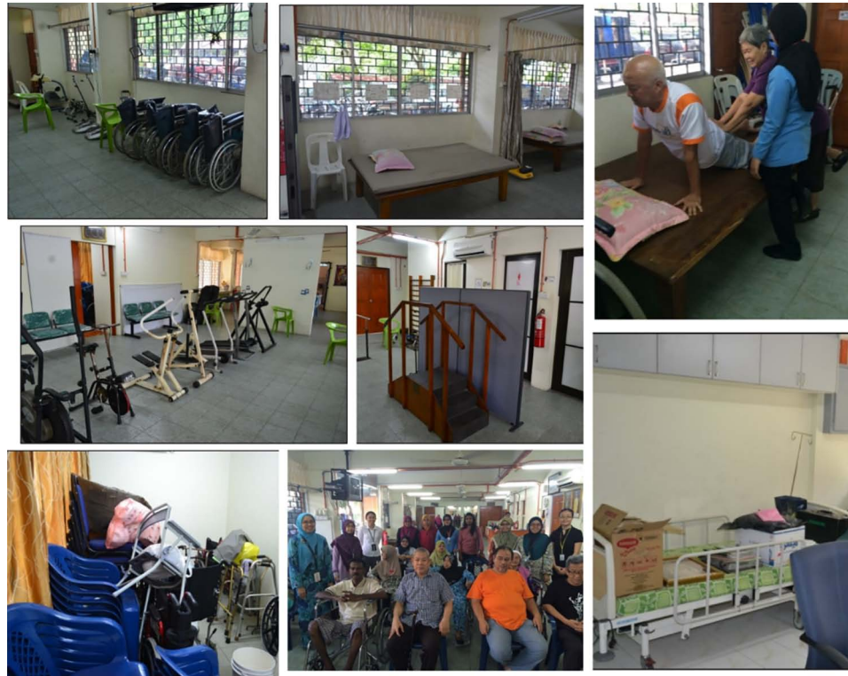
Figure 2. Prior to the launch of SCORE, the rehabilitation centre was in a dilapidated state and the equipment was dysfunctional. There was also a lack of trained staff to provide care.