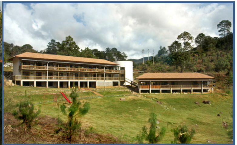
Above: Casas UV: Coyopolan, left, and Atlahuilco, right.