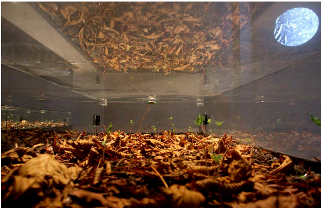
Figure 2: A close-up of Terike Haapoja's INHALE-EXHALE (2008/2013); Durational sculptures, plywood, glass, soil, CO2 sensors, sound). Programming Aleksi Pihkanen, Gregoire Rousseau.

Keeping in mind Haapoja's work but more especially in the context of Howse, Kemp and Jordan's projects, one could say there is a sense these explorations are trying to address the intensive cycles and transformations of materials of the earth.