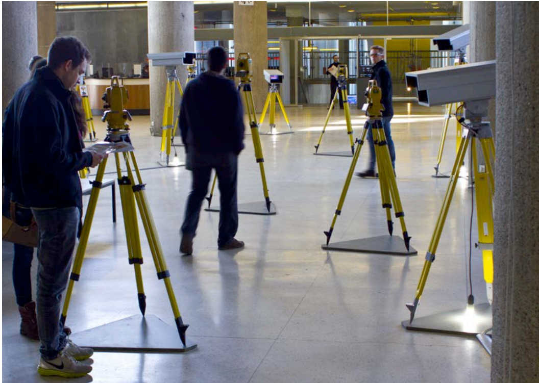
Figure 3: The geological survey of the data reality of the HKW space Allen and Gauthier's project from transmediale 2014.

entry points to visualise and think about spatial or architectural settings through their data. This approach mixed geological machinery with big data themes to address how the institutional space of HKW became a data space of interactions. It also alluded to the geology of surveillance of past years' intensive discussion around the National Security Agency (NSA) and related activities.