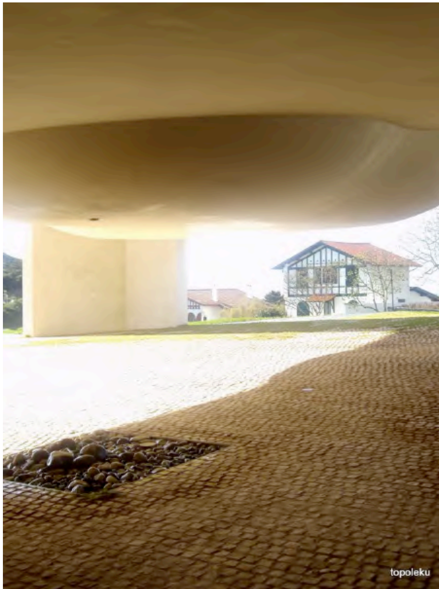
Figure 4: Cité de l'Océan et du Surf, Biarritz, by Steven Holl Architects with Solange Fabião

The architectural object, which is beautiful and sophisticated in and of itself, transmits a kind of conceptual white noise into its surrounds to extend the resolution found for the design brief by the architect–artist partnership. Tactically, this resolution stems from the level of abstraction applied by Holl and the series of decisions determining those elements of the site condition and the institutional