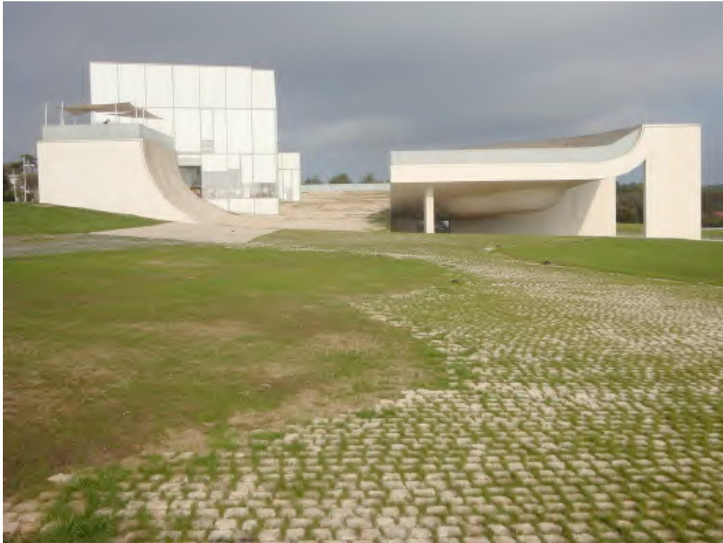
Figure 3: Cité de l'Océan et du Surf, Biarritz, by Steven Holl Architects with Solange Fabião

setting in order to realise conceptual projects as buildings, in cities, with money and building materials and labour and under regulations of various kinds, Holl nevertheless actively moves his firm's architecture towards the category of art—and therefore towards a condition insulated, even if only rhetorically, from the demands of building. Within this position, an introspection informed by an idea of formal and conceptual autonomy shapes the processes of generating and resolving architectural form and its effect in order to privilege the work of architecture as an object, where the means of its participation in institutional programs, including in what Terry Smith has called 'iconomy', and even the ways in which the work is used and maintained, take second place to its image as a resolved whole. 20