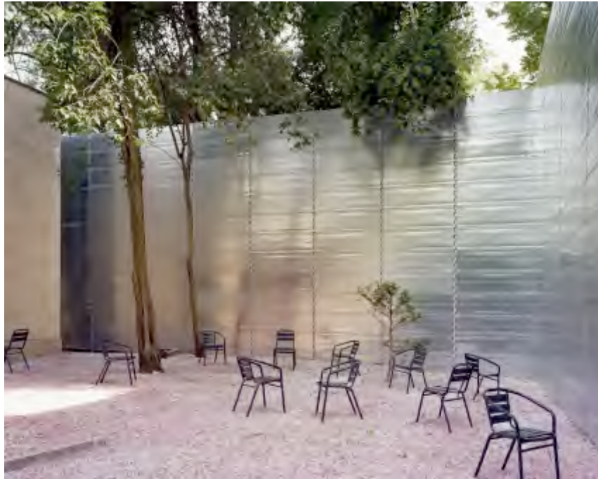
Figure 7: After the Party, by Office Kersten Geers David Van Severen