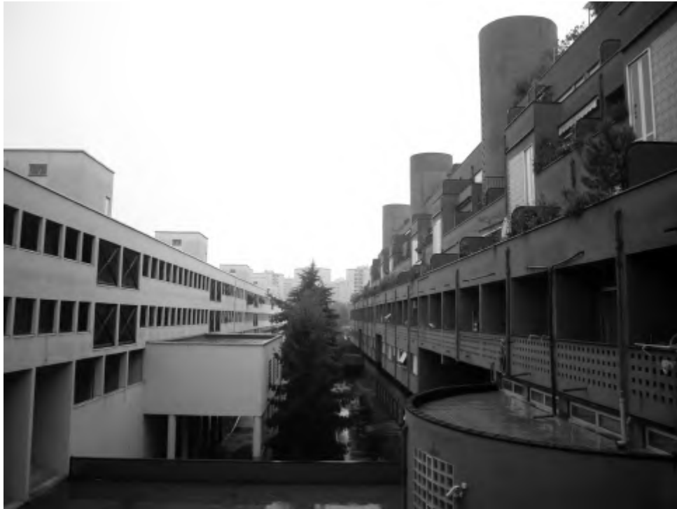
Figure 1: Quartiere Gallarate, Milan, depicting blocks by Aldo Rossi (l) and Carlo Aymonino (r)

the quotidian'. 9 In simple, compositional terms, the situation is roughly that of a late-neorationalist building appearing in the midst of a late-neorealist precinct, where the (literally) white block insisting upon order, system and rhythm met the (literally) grey complex privileging formal disjunction and typological juxtaposition. (We will return to the significance of 'white' and 'grey' below.) Tafuri invites us to read silence and noise as code for, on the one hand, a mute moment of conceptual and artistic autonomy and, on the other, architecture's integration within a technical, social, economic and political reality that necessarily determines aspects of the work, including its historicity.