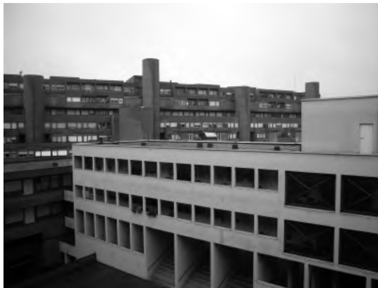
Figure 2: Quartiere Gallarate, Milan, depicting blocks by Aldo Rossi (foreground) and Carlo Aymonino (background)

Italian architectural culture of the 1960s and 1970s was informed by a heavily politicised discourse on architecture's formal and conceptual autonomy in which Aymonino and Rossi—alongside others of their generation—conducted a sustained investigation into architecture's role as an agent and index of socioeconomic and political change. The Istituto Universitario di Architettura di Venezia, where Aymonino, Rossi and Tafuri all served as professors, was arguably at the forefront of that exploration within Italy, serving nationally and internationally as a talisman for architecture's confrontation with its political dimensions. As much as that historical discourse was idiosyncratic and bound to particular historical and institutional circumstances, it shed light, then as now, on more general conditions of an architectural culture in which the encounter between ideas and reality remains awkward. According to one position of that earlier moment, architecture's efficacy lay with its rigorous isolation from the world at large; and for the other, its insistent integration.