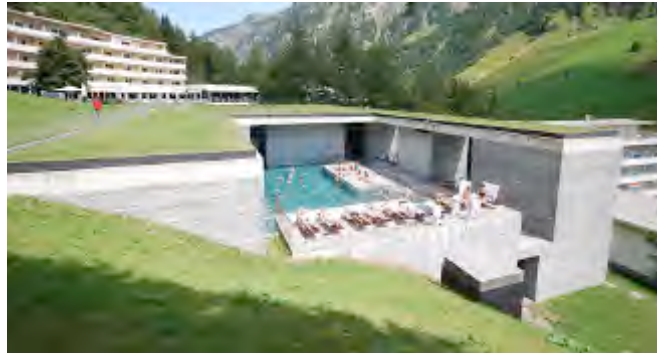
Therme Vals, by Peter Zumthor.