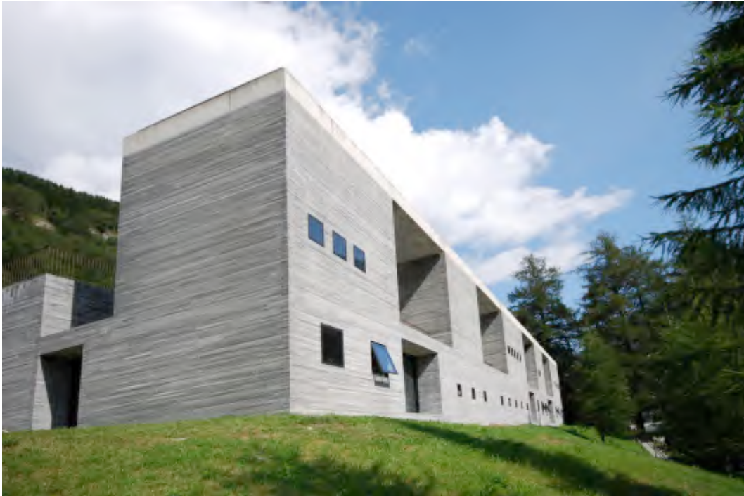
Figure 6: Therme Vals, by Peter Zumthor

field of possibilities governing the technology and techniques of architectural production. While its terms ultimately differ from those of Holl or even Rossi earlier, this tactic engages with what we have, after Tafuri, characterised as silence in that it works to sustain architecture's intellectual and technical internalities, the discrete and irreducible set of its internal considerations within which resides, on different terms in each of our cases, the very concept of architecture and its various claims as art, discipline, technique, institution and so forth. The architect-as-artist and the architect-as-craftsman each claims a specificity for architecture—Holl's aesthetic autonomy; Zumthor's technical autonomy—that sets about to reduce the interference of noise, of reality, of those extra-architectural conditions that shape architectural practice. This search for silence, either through negation or isolation, serves to define architecture as separate from the world.