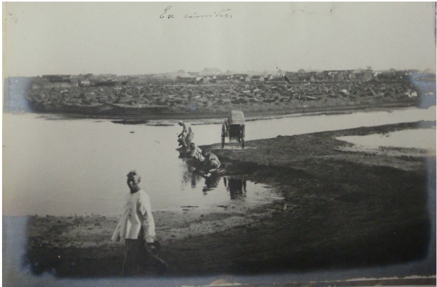
Image 2: Cemetery and marshes in the territory of the Italian concession