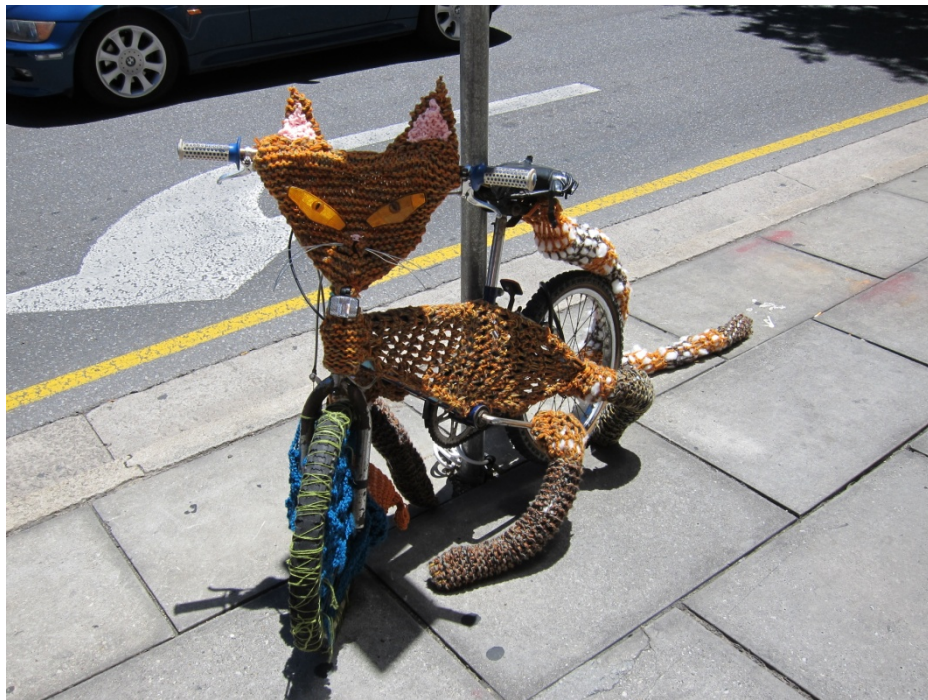
Figures 1 & 2: Yarn bombing street art, Rundle Street, Adelaide, January 2012