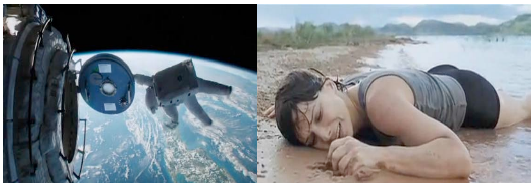
Figure 7: Screen shots from Gravity (Alfonso Cuarón, 2013)

downwards, back to earth. It is almost as if the metaphysical star child at the end of Kubrick's film has matured and returned to Earth as a fully grown woman who has suffered and struggled but who finally manages to overcome her grievances and loss. As some critics have argued, this could be seen as a sort of answer to the depressive collision of planets in Von Trier's Melancholia . 43 Fallen back on Earth, Ryan Stone is reborn. Gravity is as much a metaphysical film as Tree of Life and The Fountain . A metaphysics that asks us not to look up and away from Earth into space, but to return, discovering a 'new materialism', calling for a renewed connection to the elements of planet Earth in which our bodies, brains and screens are in a continuously evolving entanglement.