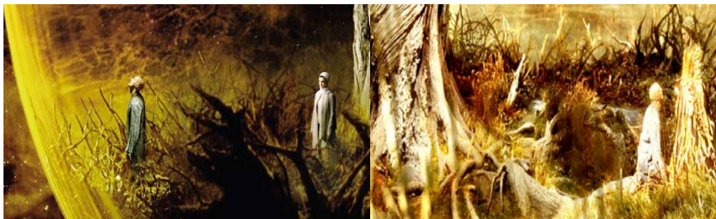
Figure 4b: Screen shot from The Fountain (Darren Aronofsky, 2006)

Many scenes are repeated throughout the film. Most striking perhaps is the scene, three times repeated, where Izzy suddenly appears, dressed in a white winter coat and a white knitted cap, to say ‘Take a walk with me.’ The first time Tom replies, saying ‘Please Izzy’, as if he wants her to leave him alone. The second time the scene plays out and we hear ‘Please Izzy,’ Tom explains that his colleagues are waiting for him for an operation. We move more deeply into that layer of time, discovering how the surgeon is obsessed with curing the fatal illness of his loved one. With the third repetition of the scene, Tom changes his mind and does follow Izzy into the snow. This will lead to Tom’s final decision to finish the story of the conquistador in the past (a story Izzy was writing and repeatedly asks him to finish), to finally die in the future (the climax of the film where space traveller Tom dies in the nebula of a dying star and becomes a celestial particle), and to accept Izzy’s death by planting a seed on her grave in the present time. The future therefore is