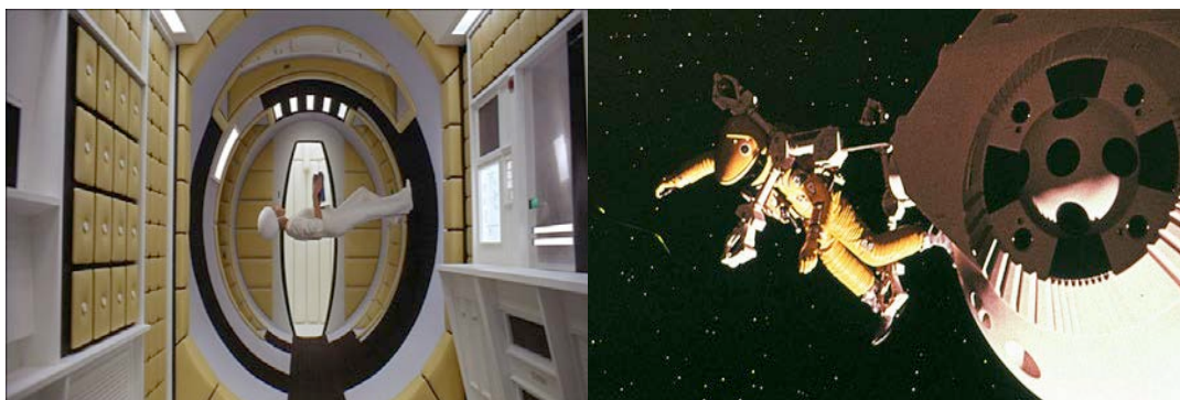
Figure 1: Screen shots from A Space Odyssey (Stanley Kubrick, 1968)

Science fiction and voyages to other planets have been part of cinematographic imagination since George Méliès' A Trip to the Moon (1902), made when actual space-travel was considered pure fantasy. In the 1950s, when aeronautic space exploration became an element in the Cold War, outer space and alien invasions appeared as metaphors for the dangers of communism and nuclear attacks in many cult films. The Day the Earth Stood Still (Robert Wise, 1951) and War of the Worlds (Byron Haskin, 1953) are the two most notable of the many cosmic Cold War allegories. While Stanley Kubrick gave his own satirical take on the Cold War and space technology in the black comedy, Dr Strangelove, or How I stopped Worrying and Learned to Love the Bomb (1964), a couple of years later he took the genre of science fiction to an entirely new level. The beautiful composition of every image of 2001: A Space Odyssey (1968), as well as the meticulous craftsmanship of the special effects of spaceships and the solar system, elevated the aesthetics of the genre as a whole. The realistic portrayal of state of the art space technology and knowledge about orbital conditions in the early 1960s added an important scientific dimension that took the film beyond mere fantasy.