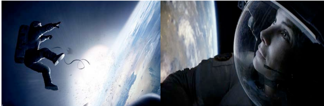
Figure 5: Screen shots from Gravity (Alfonso Cuarón, 2013)

at the Earth. So again, the idea of the future as such, the future as third synthesis of time from which to think back (and not project forward as in Kubrick's film), is the dominant temporal dimension of this film. The future was the most important dimension, even on the level of production design.. Strikingly, the film was post-produced before pre-production or production. 42 Sandra Bullock was literally strapped in a tank, a 'temporary tomb' that was her space pod, that gave her no room to move and which gave us the powerful experience of being locked in her mental space as much as her physical space.