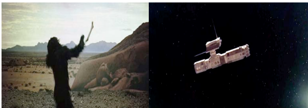
Figure 6: Screen shots from 2001, A Space Odyssey (Stanley Kubrick, 1968)

In a comparison of 2001 and Gravity the movement (or gesture) of technology is inverted. In 2001 , at the end of the prologue of the film, the famous prehistorical bone (as a first technological apparatus) is thrown up from the deep past into the future to be transformed into a cosmic space ship. Kubrick's film literally moves from the past (the dawn of men) through the present (the 1960s aesthetics in every detail of the mise-en-scene of the film) to the future (space travel that is about to happen in the real world). In Gravity , the final movement of the 'apparatus' is