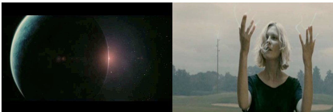
Figure 3: Screen shots from Melancholia (Lars von Trier, 2011)

Lars von Trier's Melancholia (2011) is another example. This film is the expression of pure affect, a pure intense, inner experience. It is an apocalyptic story where the Earth is hit by another planet, Melancholia. But more than that, the planet Melancholia is the expression of depression and fear, embodied by Justine and her sister, Claire.