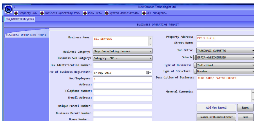
Figure 2: Adding Business records

Once the major and sub-classes are loaded on the application, then the base values for each class and sub-class are entered. The variables and indicators affecting each particular business are selected manually by checking of the variable and indicator box. However, for expediency, it is better to prepare an Excel sheet of all the major classes and include the variables and indicators affecting each business category and upload this on to application.