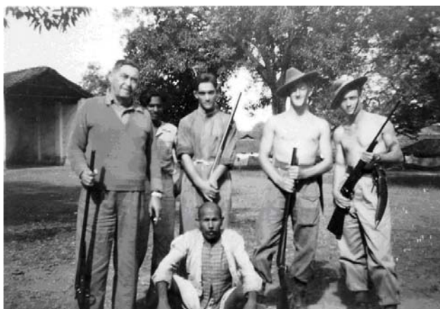
Christmas 1946 Pagdhal.