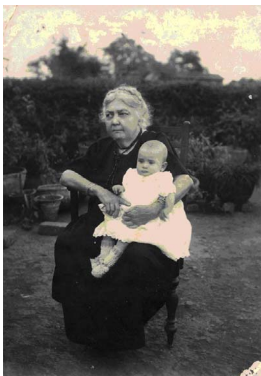
Garden in Bhusawal

A rather grim looking grandmother features in several pictures taken in studios set up to look like they were taken in an English country garden.