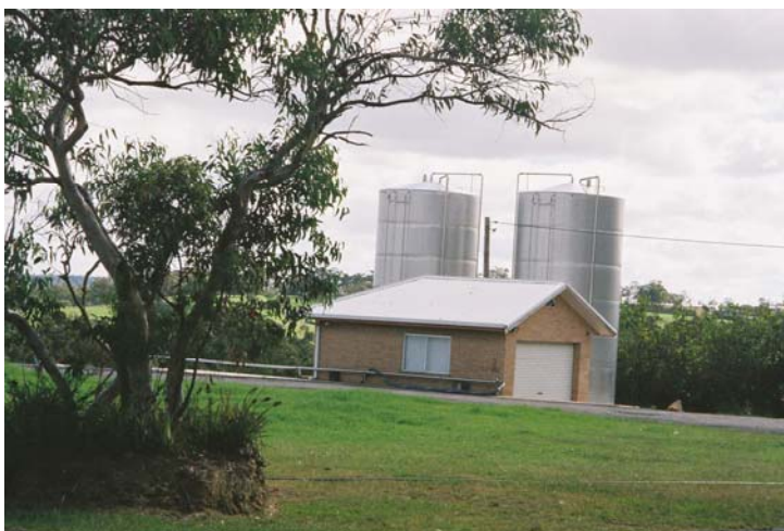
Roadside bottling plant, diseased lemon orchard in background, Peats Ridge.

To drive through Peats Ridge now is to see the shiny silver tanks of small bottling plants on lots of properties beside the road and to often pass laden water tankers heading down the ridge towards Sydney and vice versa. Since 2004 water title has been legally separated from land title in NSW, making the right to extract water from a watercourse or aquifer a tradeable commodity. Many local farmers who had purchased licenses for small bores for individual farming use have sold off their water rights in perpetuity to bottling plants, who can extract the water so purchased from wherever in the local area a main bore and bottling plant is located, rather than necessarily from the land from whence the water title was