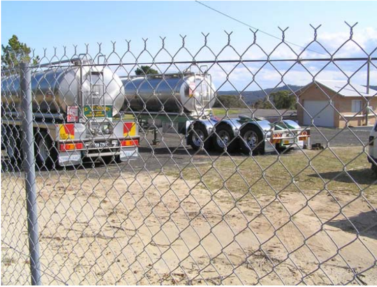
Water Tankers, Peats Ridge.

The water crisis has really hit in Sydney now. With dams running low, rainfall down and the city inexorably growing, high level water restrictions have become a daily reality in the city. Consideration of a huge investment in a sea water desalination plant is a serious part of the current public policy agenda. Laws prevent householders from filling new swimming pools with tap water unless they get a special permit and install a range of water efficient devices in their homes. Not everyone wants to commit to these constraints and so a new market for mountain water has opened up, selling water in bulk to fill the swimming pools whose spread is one of many early responses to the bite of global warming. ‘Simply pure and natural aqua: Springwater delivered to your home, watertank, pool etc’ reads the card of one local entrepreneur left for tourists to the district when they come to the local nursery to have Devonshire Tea. Television and radio ads exhort city householders to install pools and have them filled with ‘beautiful fresh water from the Central Coast’.