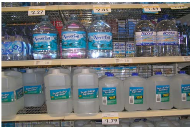
Water on Supermarket shelves, 2005.

The water crisis has really hit in Sydney now. With dams running low, rainfall down and the city inexorably growing, high level water restrictions have become a daily reality in the city. Consideration of a huge investment in a sea water desalination plant is a serious part of the current public policy agenda. Laws prevent householders from filling new swimming pools with tap water unless they get a special permit and install a range of water efficient devices in their homes. Not everyone wants to commit to these constraints and so a new market for mountain water has opened up, selling water in bulk to fill the swimming pools whose spread is one of many early responses to the bite of global warming. ‘Simply pure and natural aqua: Springwater delivered to your home, watertank, pool etc’ reads the card of one local entrepreneur left for tourists to the district when they come to the local nursery to have Devonshire Tea. Television and radio ads exhort city householders to install pools and have them filled with ‘beautiful fresh water from the Central Coast’.