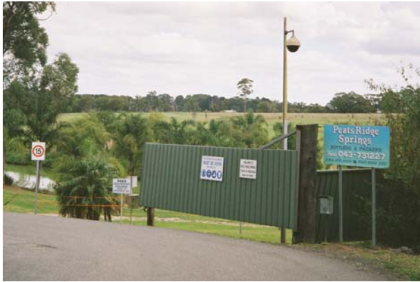
Peats Ridge Springs.

was having an impact on his family's business, and his face darkened. He denied any knowledge of the problem, whilst making clear from his body language that he could do without any stories that would detract from the squeaky clean image of their product.