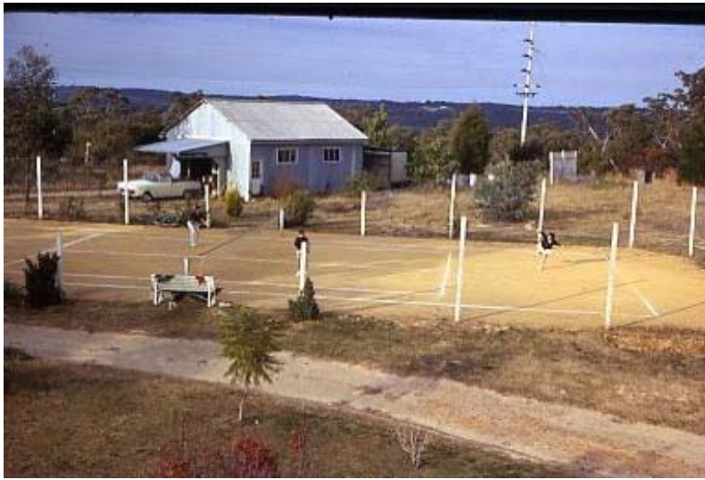
Dry Tennis Court and Lawn – Peats Ridge, circa 1968.

moved interstate, had children of my own and set up a life in suburbia. The dam and spring