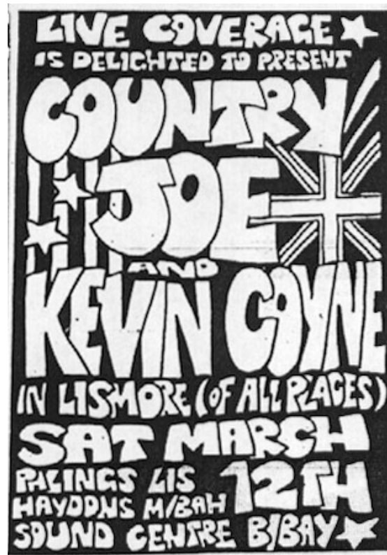
International music ‘arrives’ in Lismore, The Northern Star, 26/2/1977:11

Hall. Local advertisements for these events demonstrate the extent to which music from elsewhere was perceived to have (finally) arrived in the region, paralleling the ‘discovery’ of the region by in-migrating hippies, surfies and students. Thus, the Commercial Hotel advertised that the ‘disco scene explodes in Casino’, while a 1977 tour of Country Joe and Kevin Coyne was presented by Live Coverage tour promoters, with almost a sense of surprise, ‘in Lismore (of all places)’.