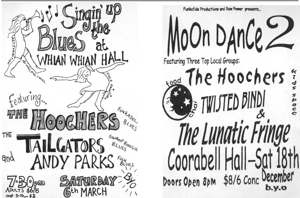
Hall gig flyers, Whian Whian Hall and Coorabell Hall