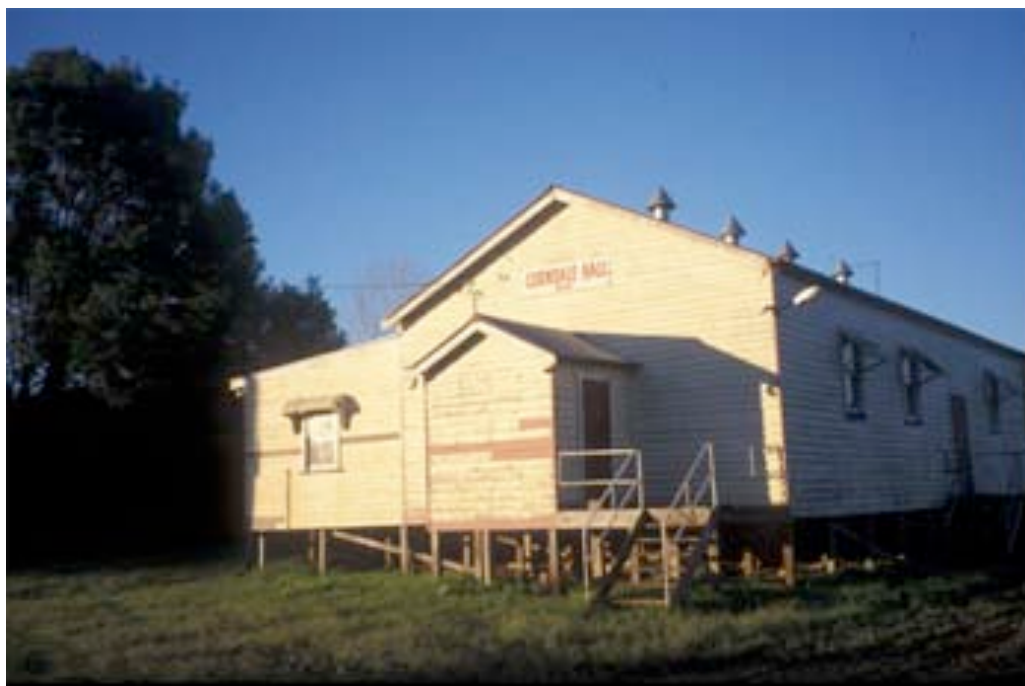
Corndale Hall, 2003

Pertinent here is that since the late 1990s there has been a second renaissance in the community hall as a space for performance, in reaction to a loss of venues in the region blamed on poker machines and greedy publicans. Village dance halls, in places such as Coorabell, Corndale, Whian Whian and Broken Head, have been transformed once