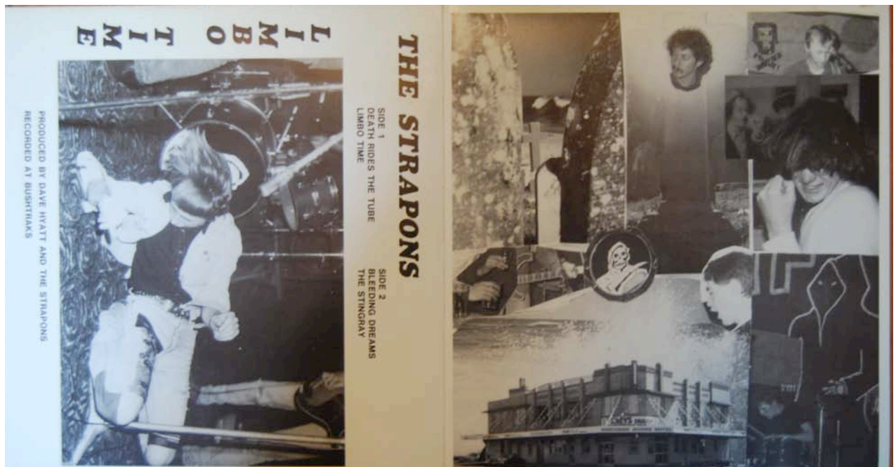
Gatefold sleeve cover to The Strap Ons, Limbo Time (c1985), 7" record, EMI Custom Records (Note the cover photographs of pub gigs in the region, and a shot of an iconic Lismore live venue, the Northern Rivers Hotel)

configuration of bands, venues, releases and musical texts mapped out figuratively and literally the shifting contours of the region's cultural and economic change.