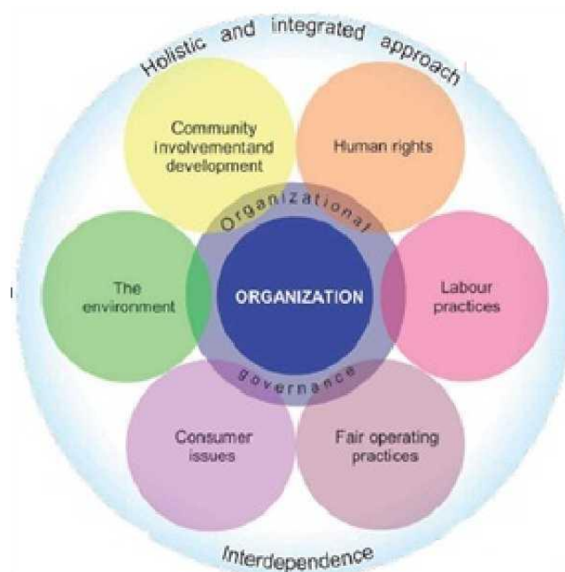
Figure 1 The inter-relationship of Seven Core Subjects (ISO 26000, 2010, p 20)

ISO 26000 (2010) was qualified as being “not a management system standard [nor] intended or appropriate for certification purposes” (p. 1) and further defines SR broadly by reference to seven principles, seven inter-related core subjects and their 36 related SR issues (pp. 10-68), as shown in figure 1.