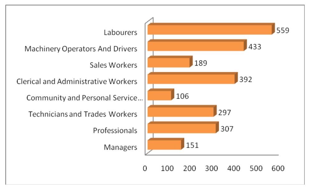
Figure 2: Occupations of Lao Australians in Sydney by numbers.

Total employed=485