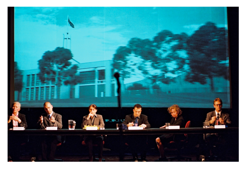
Figure 1: version 1.0's CMI.

many researchers, including myself, have been trying to explain the performances' strong impact. In the context of past academic writing about CMI , my article is written with the purpose of acknowledging the ongoing relevance of this work, and analysing its aesthetic approach and effects.