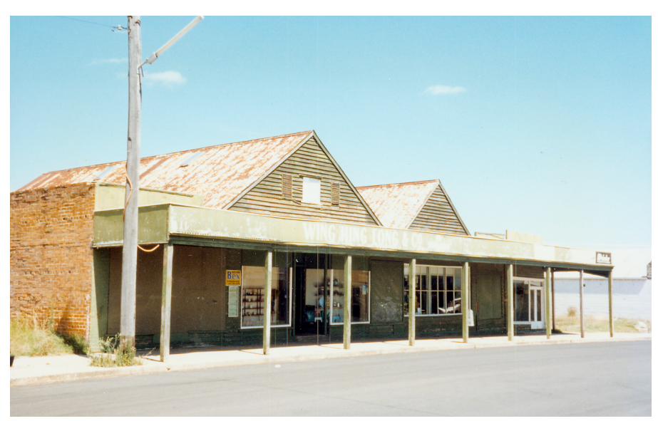
Wing Hing Long Store, Tingha, 1998

Wing Hing Long emerged as a community managed museum in the late 1990s. It was a product of the coming together of a variety of factors and forces. And its history and the memories which it presents and evokes provide a good example of the different individual and community memories and expectations which can echo around a local museum in regional New South Wales.