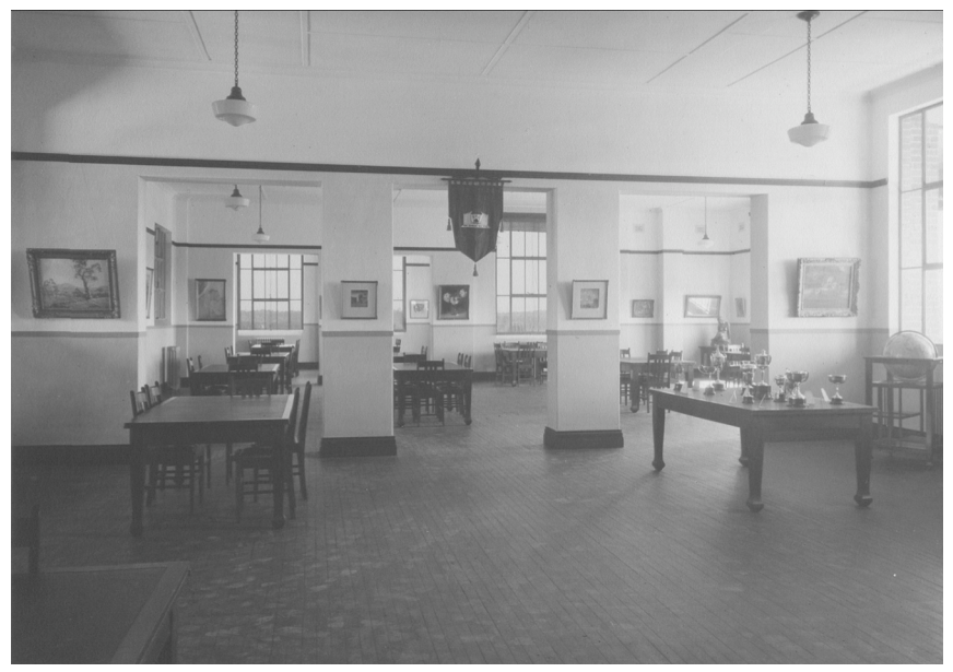
Works from the Hinton Collection in library of the Armidale Teachers' College, c1934 (Historical Resources Centre Collection, University of New England and Regional Archives)

If the memories of alumni of the Armidale Teachers' College are any indication, Hinton achieved this, at least to some extent. Tellingly, these memories – shared as alumni visit the collection in its new home – focus on both particular works and on the experience as a whole.<sup>33</sup> Some remember