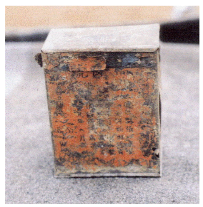
Opium container from around the turn of the twentieth century, found On the Sofala goldfields (Private collection)

localities. When first approached, the staff of some museums declared an absence of such objects though a willingness to include them while others directed us to a variety of objects. The nature of those objects identified as relating to the Chinese presence is significant. In some museums, the objects were clearly provenanced and carried labels which correctly identified the objects, their uses and, occasionally, stories associated with them. In a number of museums, however, objects were incorrectly identified: a soy sauce brownware jar labelled a Ming vase, an opium tin described as a container for returning the ashes of the deceased to China, a mortar as an incense burner, a tobacco water pipe as an opium pipe. Similar mislabelling has been identified among collections in local museums in California, that other region where gold rushes brought a significant Chinese presence.<sup>8</sup> The advice from California – and presumably from all historians and museum professionals heavily imbued with an empiricist sense and an emphasis on getting the information correct – is that the museums who are the new owners and keepers of these objects need to be better informed and the information on the labels altered.