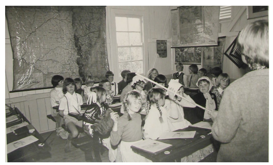
Visit to the Museum of Education, University of New England, c1980

This idea of a museum memorialising its founders and their museum practices, and these memories influencing the current shape and tone of a museum, is also evident in two other collections and museums in Armidale. Both these collections had their origins with the Armidale Teachers' College which subsequently became the University of New England.