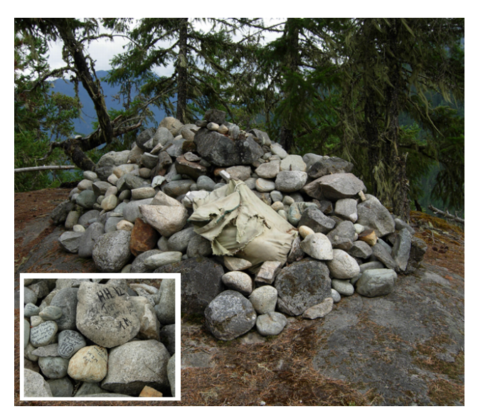
Fig 3 Cairn at Moody's Lookout, looking south down Little Lillooet River Valley

And what I used to tell the students to encourage them, because they didn't want to hike this hill, was that if they carry the rock to the top of the hill and put it here that they could do anything they wanted in life because they would know that it was here and they knew that they did something that they didn't really want to do. Now the latest thing is that people are bringing felt pens and they are writing on the rocks so people know...Just about every student who has hiked the Harrison Hike has been up here since 1976. So that's our secret vocabulary. Use 'Moody's Lookout' and no one in the world knows where it is except kids who have been up here.<sup>a</sup>