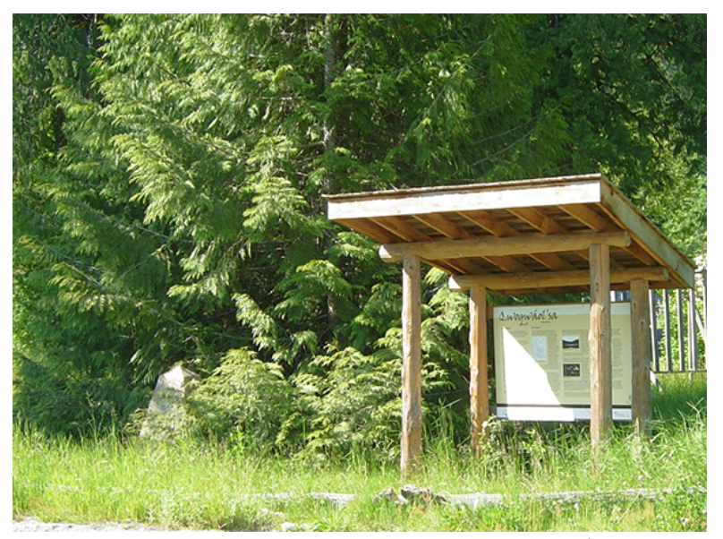
Fig 4 Information board at Qwoqwáol'sa (Port Douglas) with cairn commemorating the Gold Rush in background CONCLUSION: PART OF OUR HISTORY AND OUR FUTURE

The importance of the wagon road to the Stl'atl'imx of the lower Lillooet River Valley goes beyond official definitions of what 'heritage' is or is not. The wagon road holds an important place in their social landscape linking people from the past and present together.<sup>®</sup> Here heritage and memory are tightly linked. Remembering and sharing stories of building, using and tending the wagon road is part of making, conserving and nurturing heritage.<sup>®</sup> It is through the active process of remembering that the meaning and significance of the wagon road is negotiated.<sup>®</sup> While students may walk the road and transform themselves through this practice, the Stl'atl'imx of the lower Lillooet River Valley are part of the road itself. Their stories tell of how their lives are entwined and entangled in the road – as they are with other parts of their landscape, its human and material aspects – in a way that cannot be detached from who they are. While they may leave their traditional territories, they take the road with them.