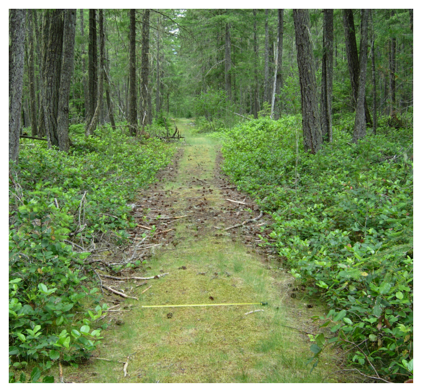
Fig 2 The wagon road, looking north, with 1 metre scale

It became evident early on in my research that the wagon road held a place of great significance to the Stl'atl'imx of the lower Lillooet River Valley. I naively arrived to their traditional territories prepared to survey the 1850s 'Gold Rush Road' and discuss its role as a colonising feature in their physical and social landscape. Known mainly for its Gold Rush past, I was under the false assumption that this road would be viewed by the Stl'atl'limx people as colonising, associated with the dispossession of their land and subjugation of their people. Instead, the wagon road was regarded with pride, associated with ancestors, community and tradition (Figure 2). The six years that the road was used as a route to the gold fields meant little in comparison to its role in their daily lives and those of their ancestors in the intervening 150 years. It was the embodied routine ( habitus ) of using and maintaining the wagon road that created and reaffirmed its place in memory and in their social lives.<sup>s</sup>