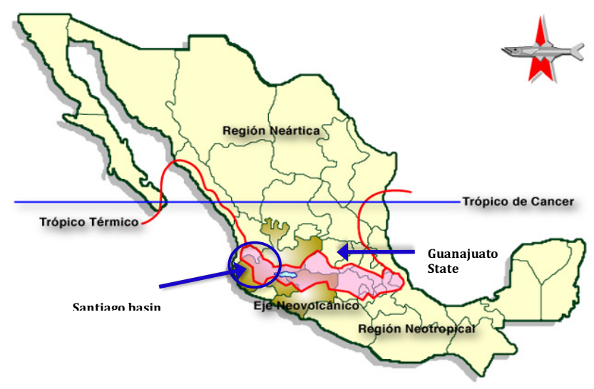
Map 1: Mexico, showing the study area: Santiago basin<sup>16</sup>

Disputes over the allocation of water resources have now become a significant political and economic factor in the region. Water scarcity has become the major limiting factor of economic growth in the Santiago river basin as well as a risk factor for the stability of major local cities of the state, such as the capital, Guadalajara.<sup>14</sup> The state of Guanajuato, which borders the Santiago basin and is the home to an industrial cluster, also suffers from significant water limitations. Tagle states that the water deficit in Guanajuato has reached 128 million cubic metres.<sup>15</sup> To solve the water deficit problem, a decision was taken to construct a 140 kilometre aqueduct to carry 3.8 cubic metres per second of water from the Santiago River to the industrial districts and the development of urban areas in Guanajuato.