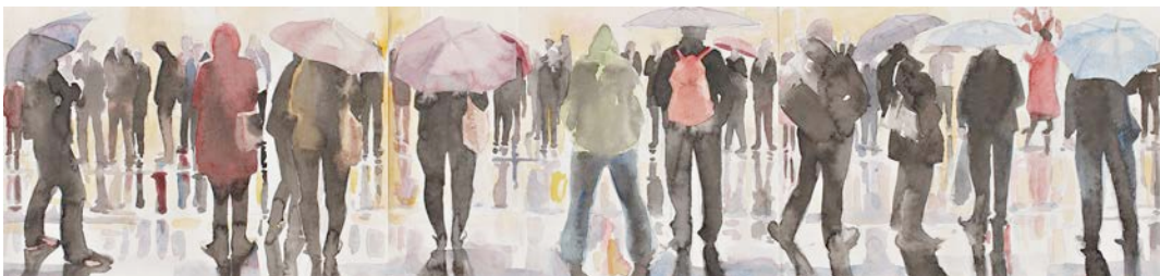
Figure 6: Barbara Bolt, Study for Bourke Street 5pm , 2012, watercolour on arches, 45 cm x 113 cm