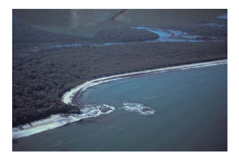
Figure 3 : Red Point, Jervis Bay – Marine park sanctuary zone and location of customary fishing.

Bay are a sentient being, linking the past with the present, through creation stories, song lines and memories about places of ceremony, ritual and everyday life. Many of these traditional places are still in use<sup>6</sup> and Jervis Bay is a rare example in 'settled' Australia of unbroken connections between Aboriginal people and their country, from thousand of years ago, surviving policies of exclusion in missions and then assimilation, until the present period when rights are being exerted over this landscape of multiple meanings.