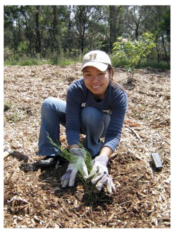
A young member of the Karen community planting a tree during the Operation Bluetongue outing.

Another way this program could help with this familiarisation was with the Karen, the minority group in Burma.