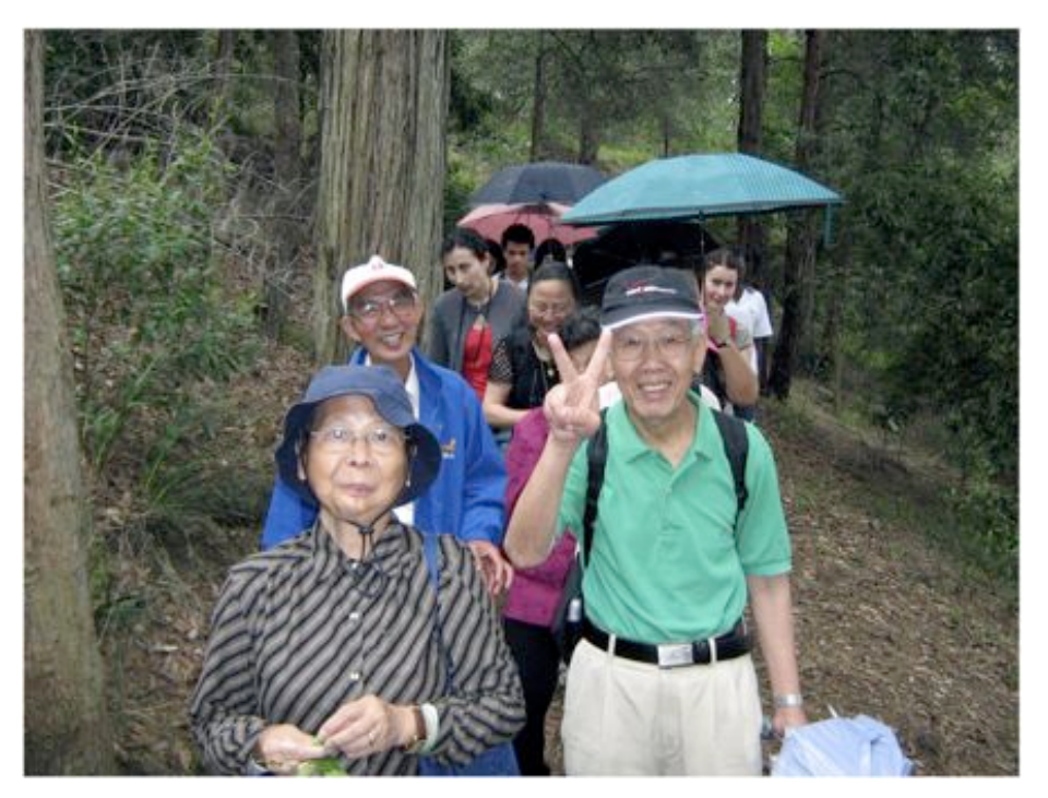
A Bushwalk along the Parramatta River

I'd like to move on from the environmental study, to look at the social side because that's also been my background. Although you might start with something like environmental education, or whatever you decided to do, after working with so many group, with so many people, they actually get a great deal of the social element to it, which is so important for them. And it's so important for us to recognise.