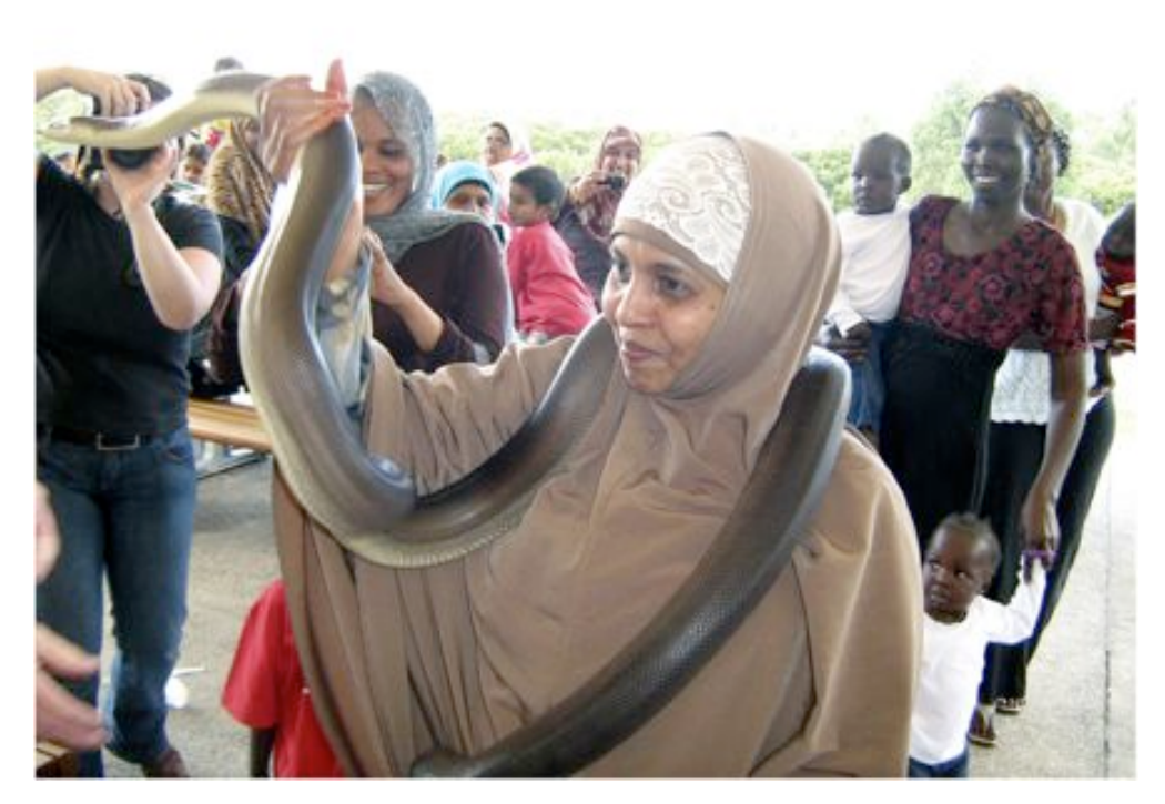
Women's African Refugee group, Olympic Park

much into that. Then after that we would have an animal display, with real live animals, all from the Sydney area. The people had an opportunity to touch and take photos. This was aimed at breaking down the misconceptions they might have about wildlife in Australia. I like it that sometimes movies like Crocodile Dundee showed Australia to the world, but it made a lot of people scared. So when people come here they had a lot of fears about dangerous snakes and poisonous spiders and all that. So that was a good opportunity for people maybe to break those fears. Often in that one hour workshop I would say, 'Yeah there are snakes out there, but that shouldn't stop you going into nature, that doesn't stop you to enjoying the Australian environment.'