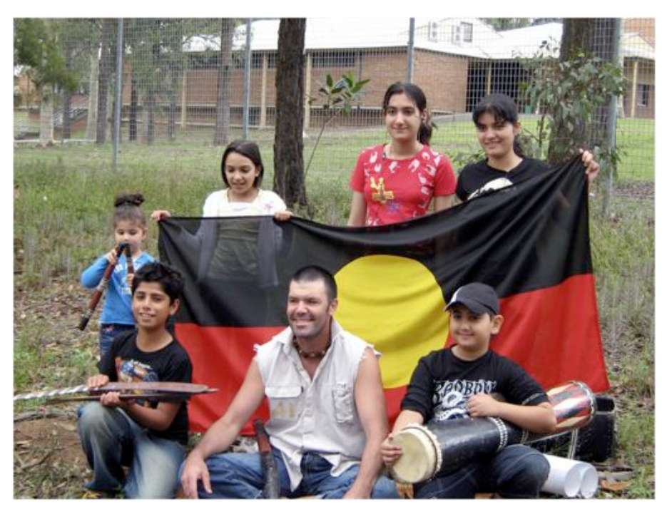
Iraqi Minority group (Mandaeans) learning about Aboriginal Culture during an Operation Bluetongue outing.

It made me think about the importance of (the) environment. It's our responsibility to keep good habits and to keep a good web of life. (Anonymous, NSW Adult Migrant English Service, Surry Hills)